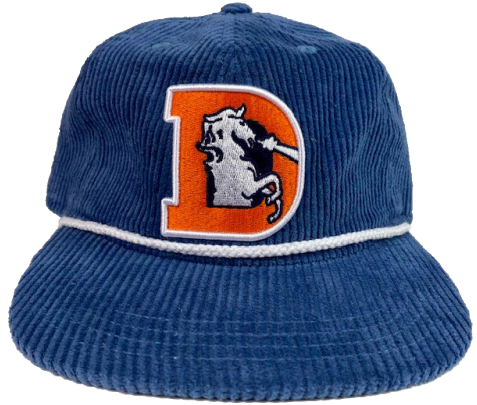
Custom Unstructured Corduroy