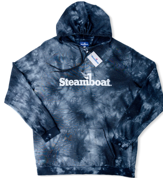
Custom Tie Dye Hoodie

Athletic fabric and cut, heavy duty zippers, gold screen printing, and branded inside label