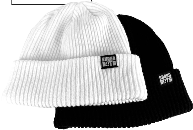
Clamp Tag Beanie

Two-sided tag, chunky knit beanie, two-way wear