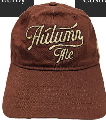
Custom Unstructured Baseball