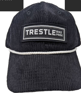
Custom Unstructured Corduroy