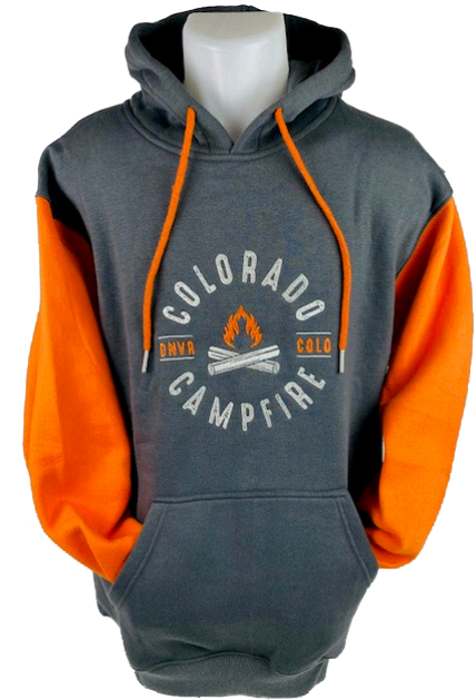
Custom Heavyweight Hoodie

Custom Tie-Dye pattern, Inside Tags, screen printed chest, metal drawstring tips