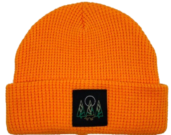
Custom Waffle Beanie

Cuffed beanie with pom-pom with 2 knit patterns and PVC patch