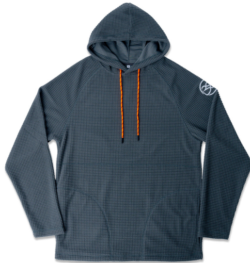
Custom Performance Hoodie

Athletic fabric and cut, heavy duty zippers, gold screen printing, and branded inside label