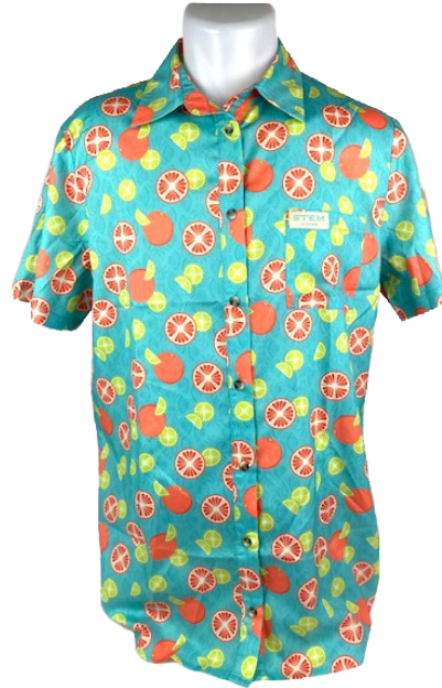
Custom Button-Ups and Work Shirts

Sublimated camo pattern, contrast striped edging, sublimated logos and sew branded inside tags