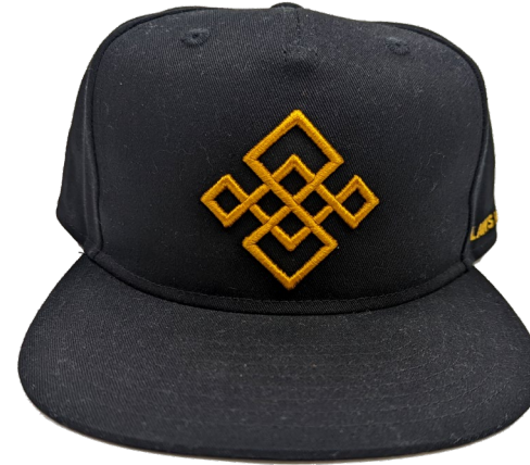
Custom Structured Flat Brim