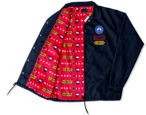
Custom Coaches Jacket

Ripstock fabric, custom patches, custom patterned lining