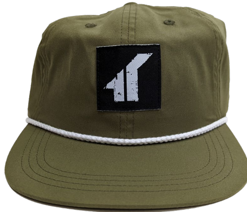
Custom Unstructured Yacht Hat