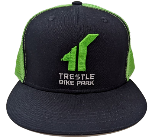
Custom Structured Trucker