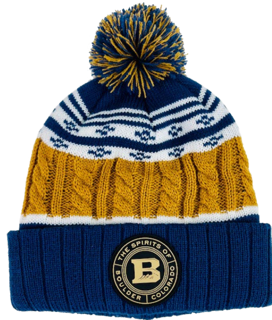
Custom Pom-Pom Beanie

Two-sided tag, chunky knit beanie, two-way wear