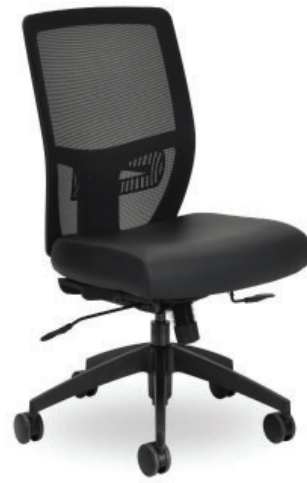
Pictured Model RM210 N23 BSB 300 lb Mesh Back with Synchro Tilt Mechanism, and black spider base