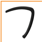
BPA - $122

T-style, height and width adjustable arm. Arm pads pivot and slide backward & forward.