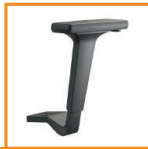
D3 - $175

T-style, height and width adjustable arm.