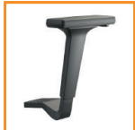
D2 - $155

T-style, height and width adjustable arm.