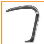
PAA - $210

C-style fixed height arm. WAB NOT available.