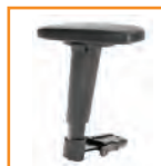
T4 - $195

T-style arm. Angled. Height & width adjustable. Button activated, 3" height range, 1 1/2" width range