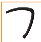
BPA - $134

T-style arm. 4-way adjustable with urethane pad