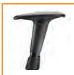
TA - $210

T-style arm, urethane pad, height adjustable. Button activated, 3 1/4" height range