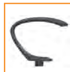
CS - $134

C-style fixed height arm. WAB NOT available.