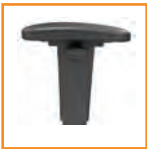
TC - $146

T-style arm, urethane pad, height adjustable. Button activated, 3 1/4" height range