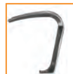
PAA - $272

C-style fixed height arm. WAB may be added.