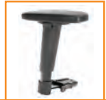
T4 - $195 T-style, angled, with urethane pad. 4-way adjustable.

arm choices - a full list of available arms can be found on page 5