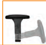
TS - $299 T-style arm with urethane pad and swing back (75°), height adjustable