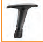
TA - $210 T-style, angled, with urethane pad. Height & Width adjustable.