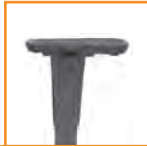
TE - $304 T-style with gel comfort pad. Height adjustable.