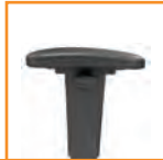
TL - $146 T-style with urethane pad. For lower arm heights. Height adjustable.