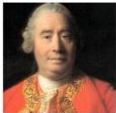
DAVID HUME, philosopher (1711–1776)

Humanists support freedom of belief. We should be allowed to question each other and disagree. However, we should not tell people what they must believe.