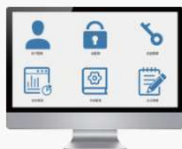
BACKEND PROCESS MANAGEMENT SOFTWARE