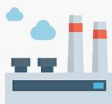
INFORMATION MANAGEMENT TO WORKING ENVIRONMENT