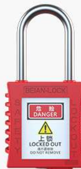
PSSIVE IOT PADLOCK