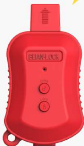
ELETRONIC KEY (E-KEY)