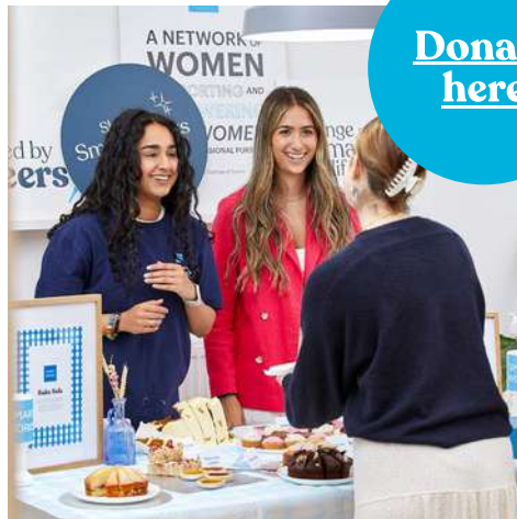
Raise and donate funds