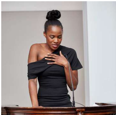
Have us speak at your event