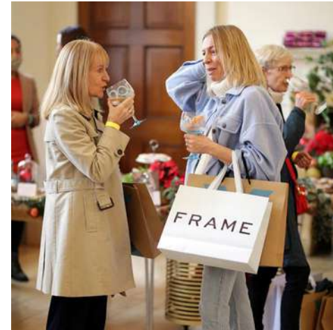
Attend one of our Fashion Sales