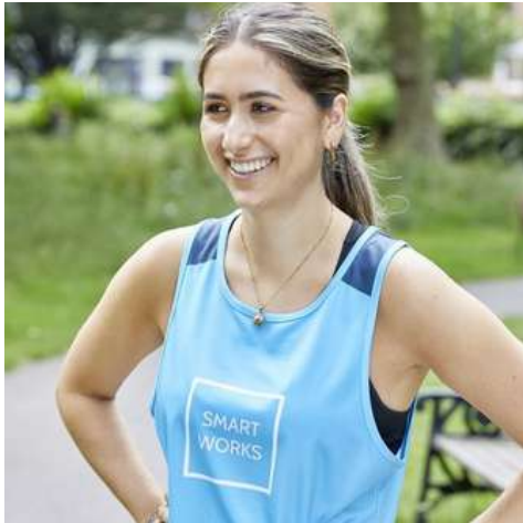
Step Up for Smart Works