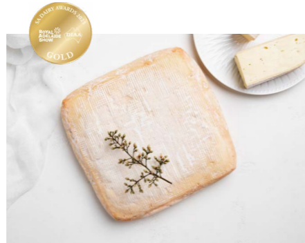
LAVATO Washed rind cow milk cheese (Taleggio style)