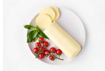
PROVOLONE Mild cow milk provolone log