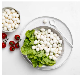
BABY BOCCONCINI 4g Petite sized mozzarella