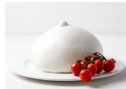
BUFFALO ZIZZONA 3Kg approx Handmade Buffalo milk mozzarella