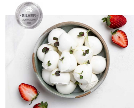
BUFFALO BOCCONCINI 25g Bite size buffalo milk mozzarella