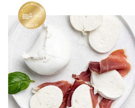
BUFFALO MOZZARELLA 125g Plump ball of buffalo milk mozzarella