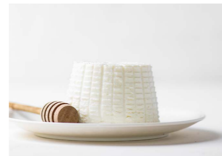
BUFFALO RICOTTA Traditional whey ricotta made from buffalo milk