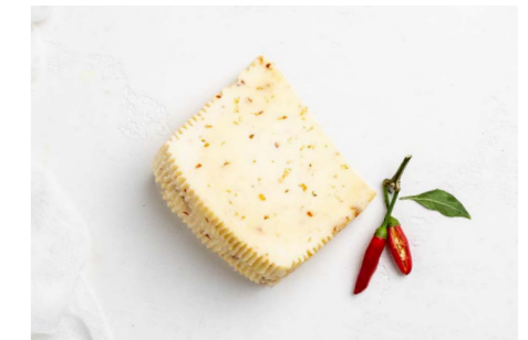
CACIO CHILLI Cow milk cheese with chilli (pecorino style)