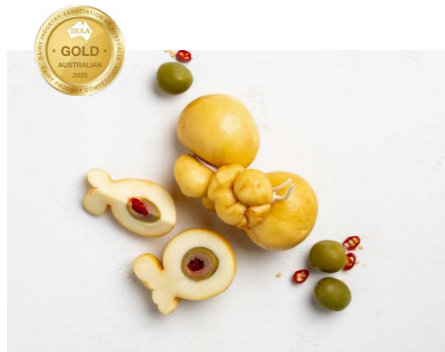
DIAVOLETTI Smoked provolone filled with olive and chilli