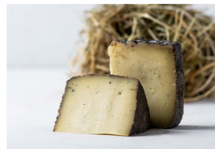
SECRETS OF THE FOREST 80% buffalo milk cheese with black truffles, matured in hay