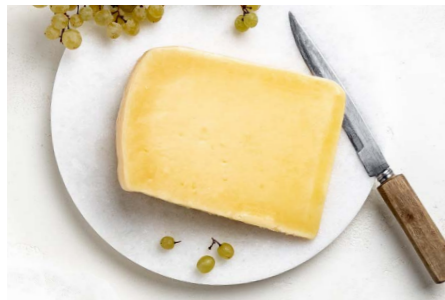
NABUCCO Semi matured cow milk cheese