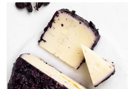
DRUNKEN BUFFALO 80% buffalo milk cheese, matured in Nebbiolo grape skins and must