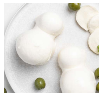
SCAMORZA BIANCA Gourmet mozzarella