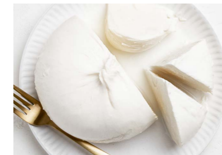
BUFFALO AVERSANA 1Kg Handmade Buffalo milk mozzarella