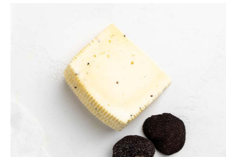
CACIO TRUFFLE Cow milk cheese with black truffles (pecorino style)