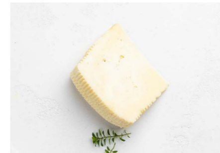
CACIO Cow milk cheese (pecorino style)