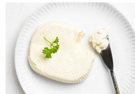
SQUACQUERONE Soft and spreadable cheese (stracchino)