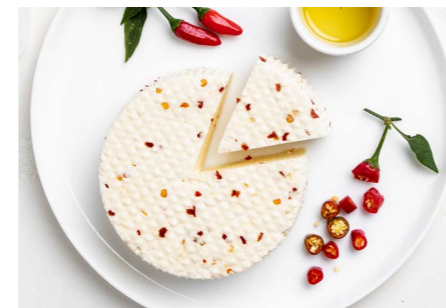
CACIOTTA WITH CHILLI Fresh cow milk cheese with chilli