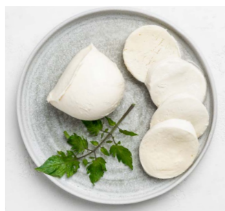
FIOR DI LATTE 125g Plump fresh mozzarella