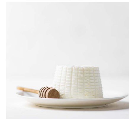
BUFFALO RICOTTA Traditional whey ricotta made from buffalo milk