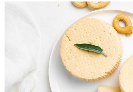
SMOKED CACIOTTA Fresh cow milk cheese, smoked