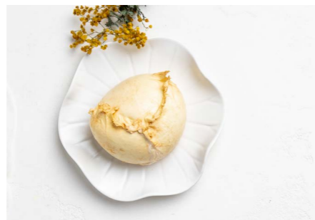
SMOKED BUFFALO MOZZARELLA 125g Beechwood smoked buffalo milk mozzarella