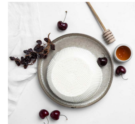
TRADITIONAL RICOTTA Traditional whey ricotta with a soft texture