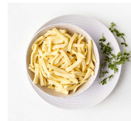
FIOR DI LATTE TAGLIO Julienne cut fior di latte