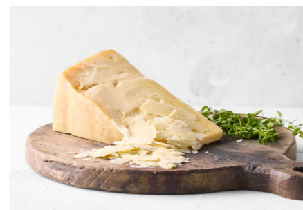
GRANAMORE Italian grana style cheese