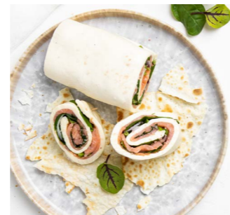
BOCCONCINI LEAF Flat mozzarella sheets, ready to be filled and rolled