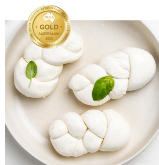
TRECCE 125g Hand braided mozzarella