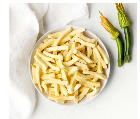
NAPOLI CUT Julienne cut mozzarella