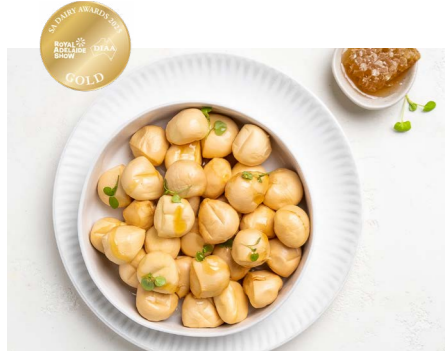
SMOKED BOCCONCINI 10g Bite sized smoked mozzarella