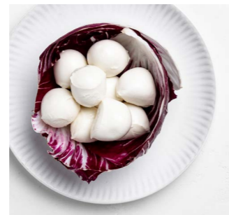
BOCCONCINI 25g Bite sized mozzarella