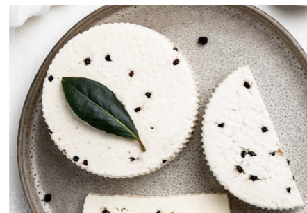
CACIOTTA WITH PEPPER Fresh cow milk cheese with black peppercorns