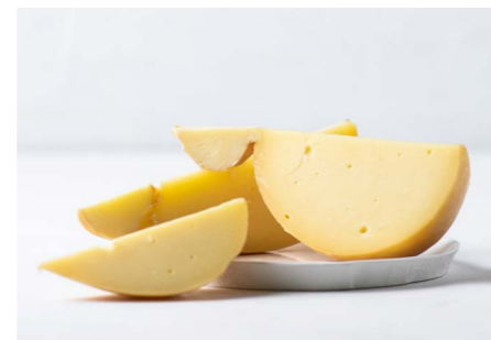
SMOKED CACIOCAVALLO Aged smoked mozzarella