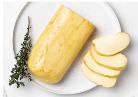
SCAMORZA AFFUMICATA Gourmet smoked mozzarella