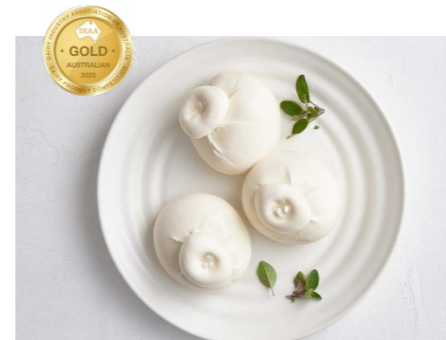
BURRATA 90g/125g Decadent mozzarella filled with stracciatella