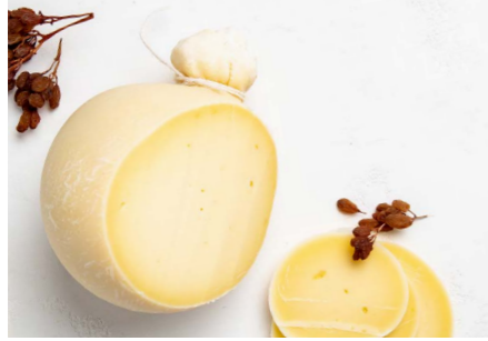
CACIOCAVALLO Traditional aged mozzarella