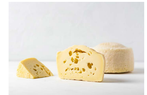
PANETTONE Semi matured cow milk 'eye cheese'