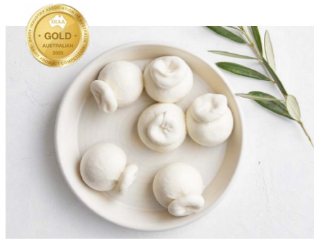
BABY BURRATA 30g Decadent mozzarella filled with stracciatella