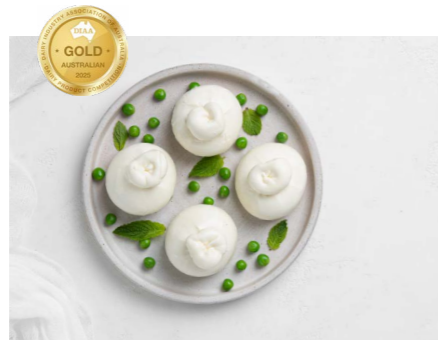
MINI BURRATA 60g Decadent mozzarella filled with stracciatella