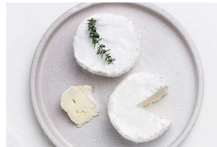
STELLA ALPINA MINI Semi soft alpine-style mould ripened cheese