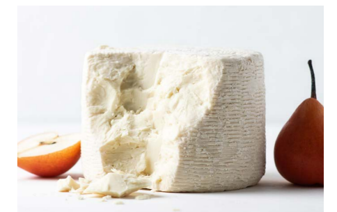
BUFFALOTTO 80% buffalo milk cheese, matured for 12 months