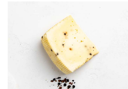
CACIO PEPPER Cow milk cheese with black peppercorns (pecorino style)