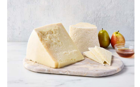
PECORINO ROMANO DOP Hard Italian sheep milk cheese