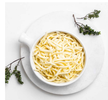
SHREDDED MOZZARELLA Finely shredded mozzarella