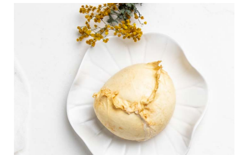
SMOKED BUFFALO MOZZARELLA 125g Beechwood smoked buffalo milk mozzarella