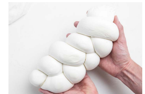
BUFFALO TRECCIA 1Kg or 2Kg Hand braided buffalo milk mozzarella