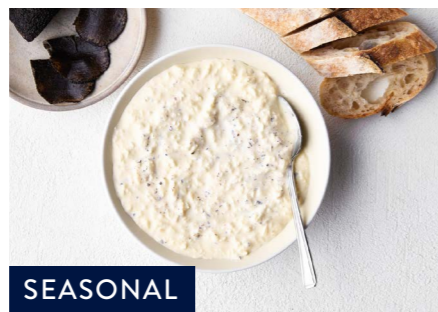
TRUFFLE STRACCIATELLA Mozzarella strips in truffle cream