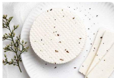
CACIOTTA WITH TRUFFLE Fresh cow milk cheese with black truffles