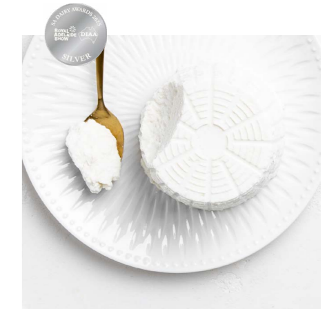
RICOTTA DELICATA Smooth and delicate whey ricotta