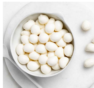
CHERRY BOCCONCINI 10g Cherry sized mozzarella