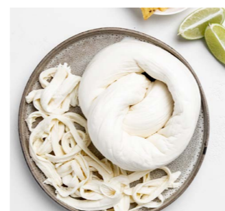
OAXACA String-type Mexican style Mozzarella