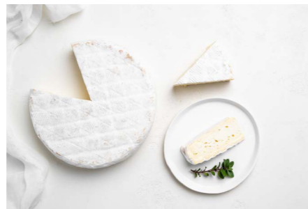
STELLA ALPINA Semi soft alpine-style mould ripened cheese