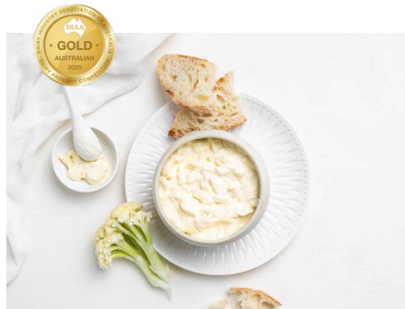
STRACCIATELLA Mozzarella strips in cream (burrata filling)