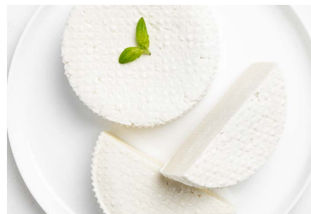
CACIOTTA Fresh cow milk cheese with a semi soft texture