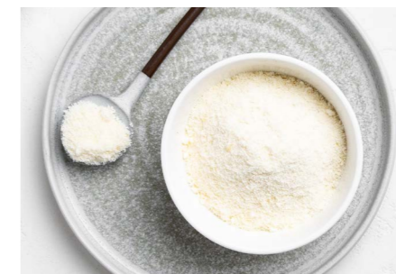
GRATED PARMESAN Finely grated Australian parmesan cheese