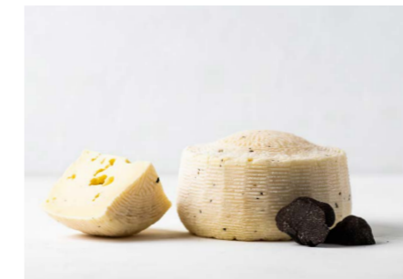
PANETTONE TRUFFLE Semi matured cow milk 'eye cheese' with black truffles