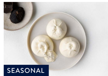
TRUFFLE BURRATA 90g Decadent mozzarella filled with truffle stracciatella