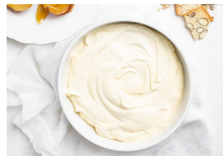
MASCARPONE Italian-style cream cheese