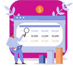
ESG Reporting Validation