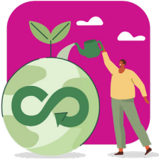
Program Readiness Assessment