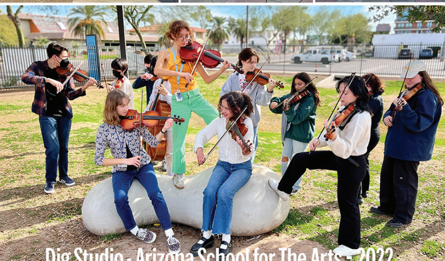
Dig Studio - Arizona School for The Arts - 2022