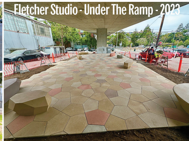
Fletcher Studio - Under The Ramp - 2023