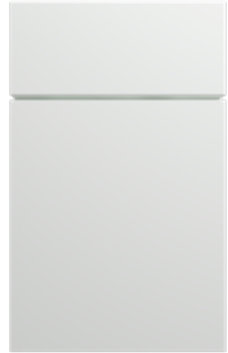
High Gloss Perfect White