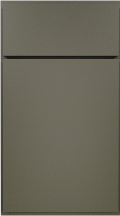
Shown in Fossil Grey