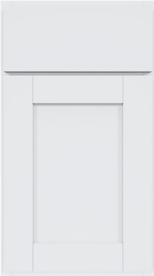
Shown in Perfect White