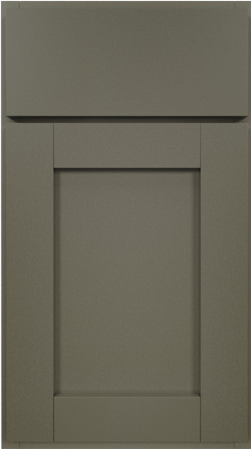
Shown in Fossil Grey