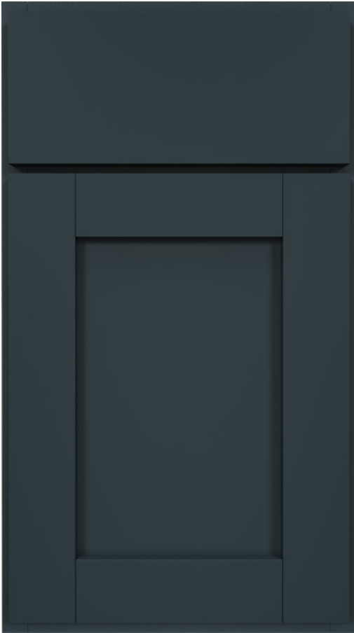
Shown in Velvet Blue