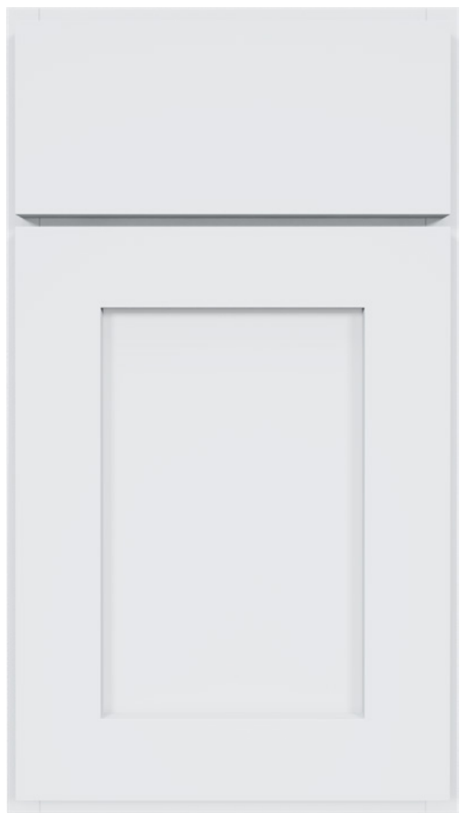
Shown in Perfect White