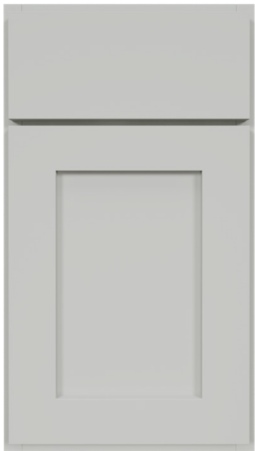
Shown in Dolphin