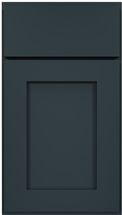
Shown in Velvet Blue