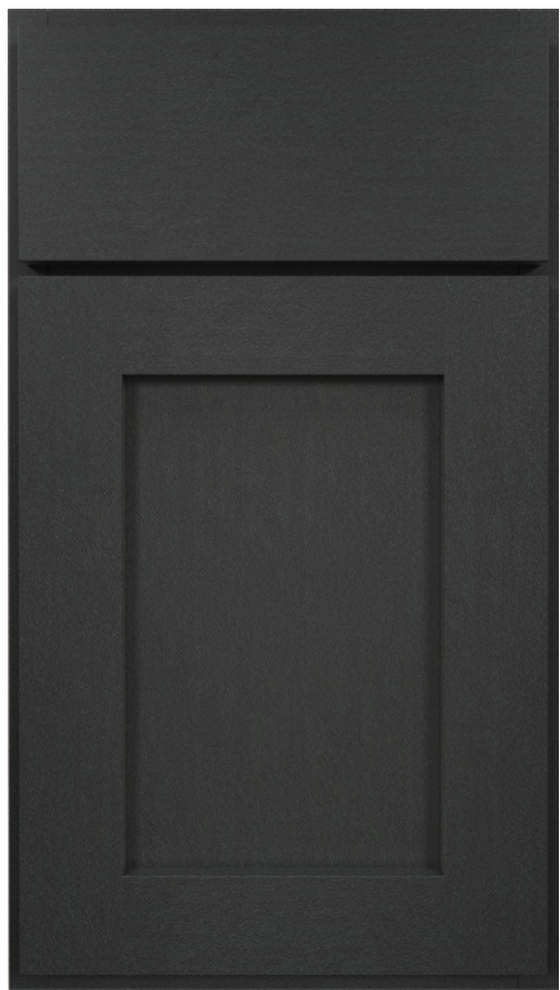
Shown in Slate