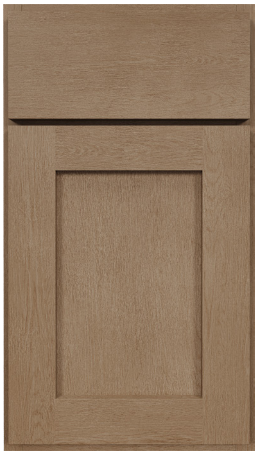
Shown in Latte