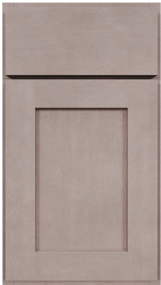
Shown in Sea Salt