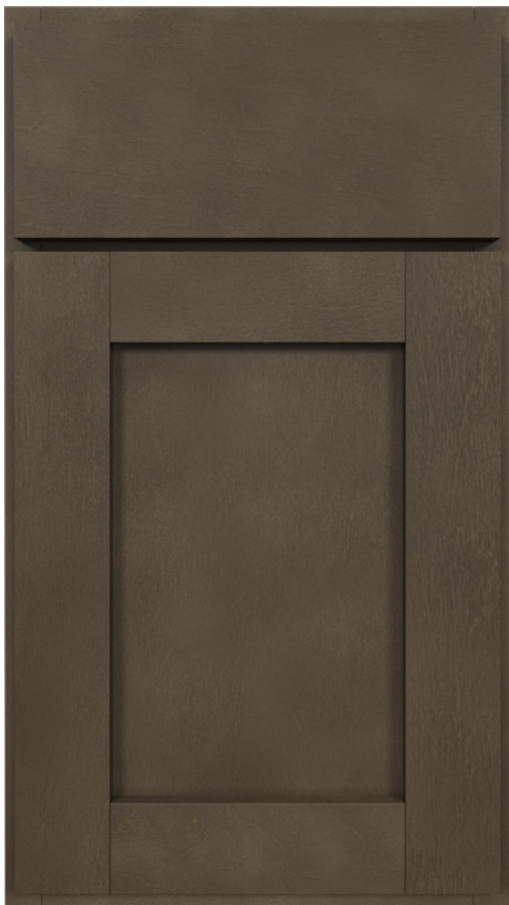
Shown in Gibraltar