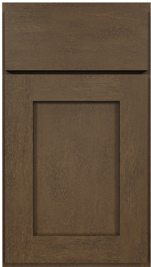
Shown in Kona