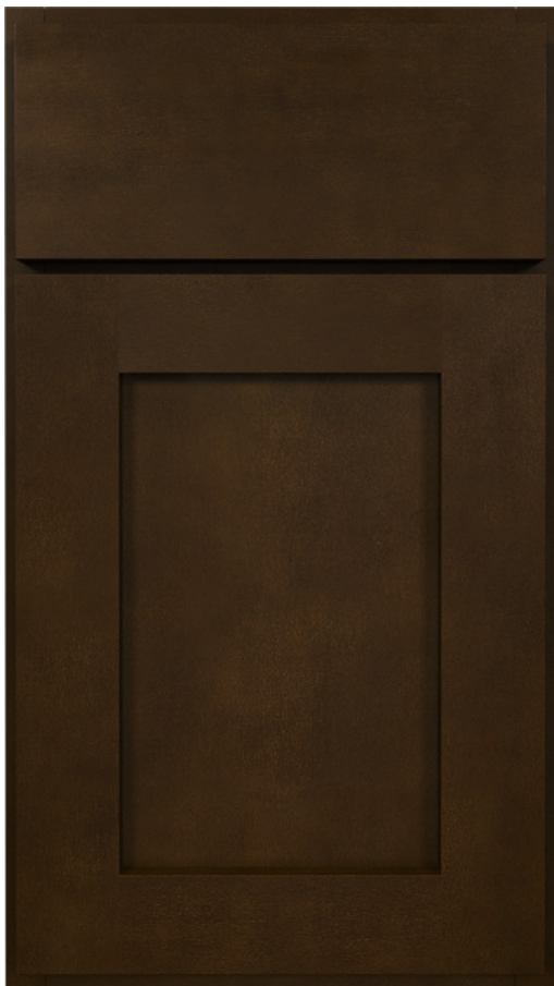
Shown in Java