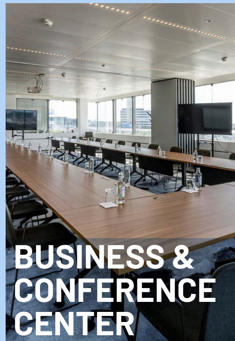
BUSINESS & CONFERENCE CENTER