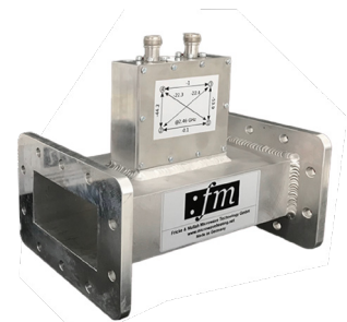
Directional Coupler R26 FM-HLR26FD00200FDGX