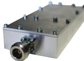
Power Detector Device FM-PD1CH2450N