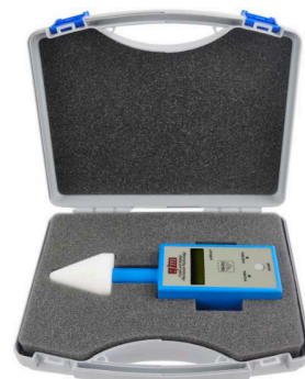
Practical transport case