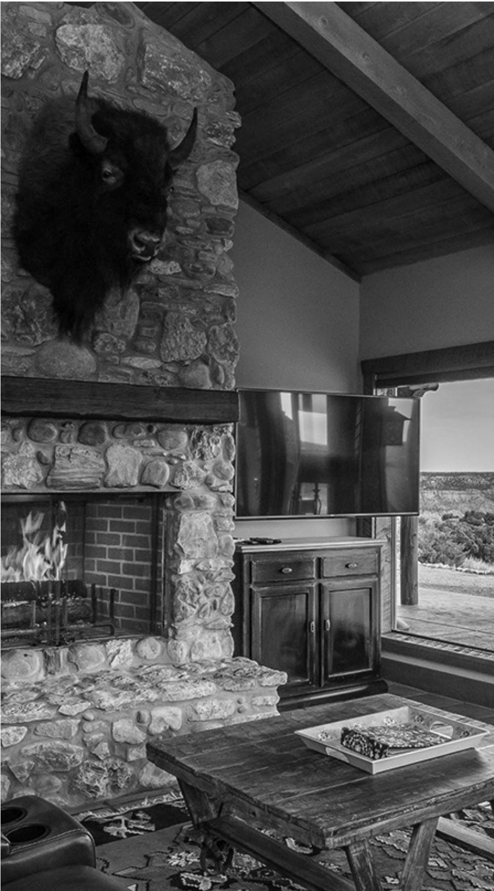
PALO DURO from page 1

is crisp, the views stretch endlessly and our cabins become the coziest hideaways imaginable. It is the perfect season to slow down, reset and appreciate the quiet beauty that surrounds us.”