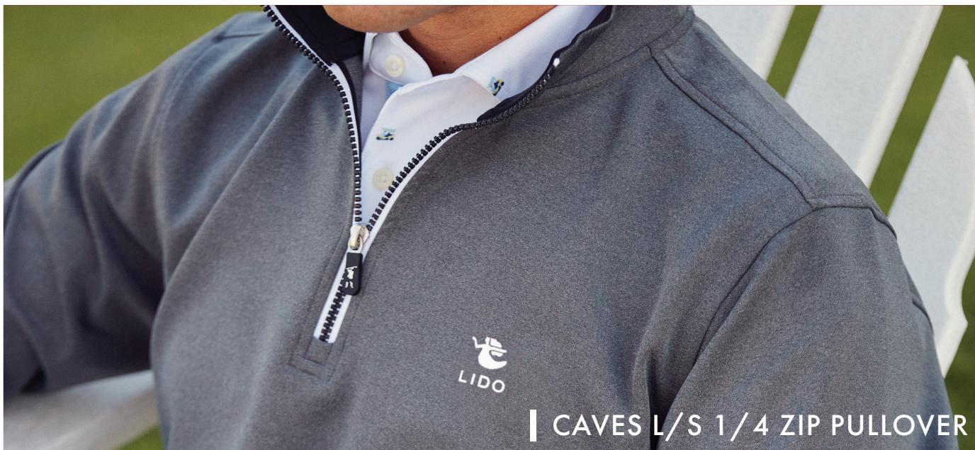
CAVES L/S 1/4 ZIP PULLOVER