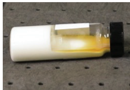
600 SC Standard

Some separation and precipitation observed.