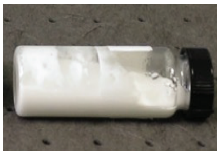
200 SC Standard

No separation or precipitation in the formulation.