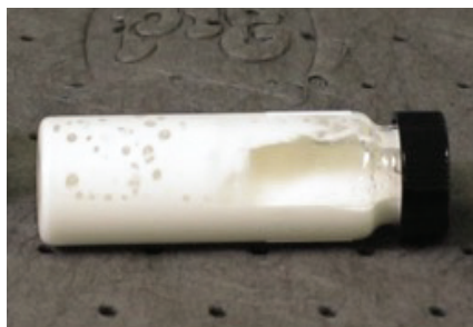
Contrado® 200 SC

Quali-Pro is committed to providing the highest quality products, from innovative active ingredients to superior formulation types. No product advances in development unless the formulation meets or exceeds the quality and performance of the competitive benchmark. Contrado SC is no exception! With many chlorantraniliprole options on the market, what sets them apart?