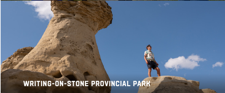
WRITING-ON-STONE PROVINCIAL PARK