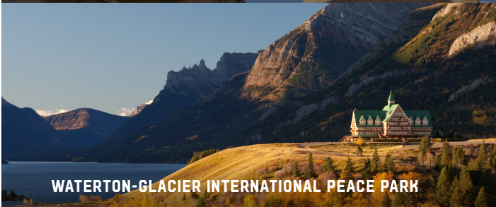
WATERTON-GLACIER INTERNATIONAL PEACE PARK