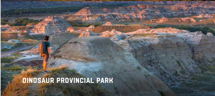
DINOSAUR PROVINCIAL PARK