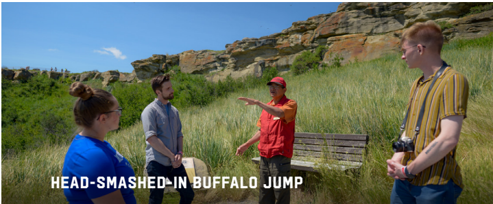
HEAD-SMASHED-IN BUFFALO JUMP