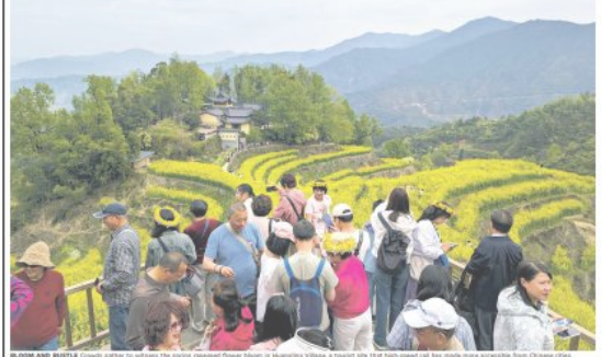
ROOM AND RATTLE Crowds gather to witness the Spring Equinox event in Huangling Village, a tourist site that high-speed rail has made more accessible from Chinese cities.