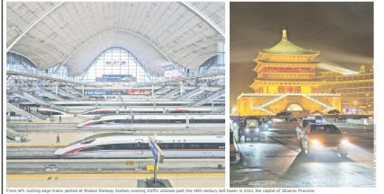
From left: Catching high-speed train at Wuhan Railway Station, entering Beijing via the 140-year-old Beijing-Tianjin Express, the capital of Shaanxi Province.

A s I stepped out of Shanghai's airport, I caught an early morning train to Beijing. The speed of the train was incredible, and the view of the countryside was breathtaking. BEFORE AFTER