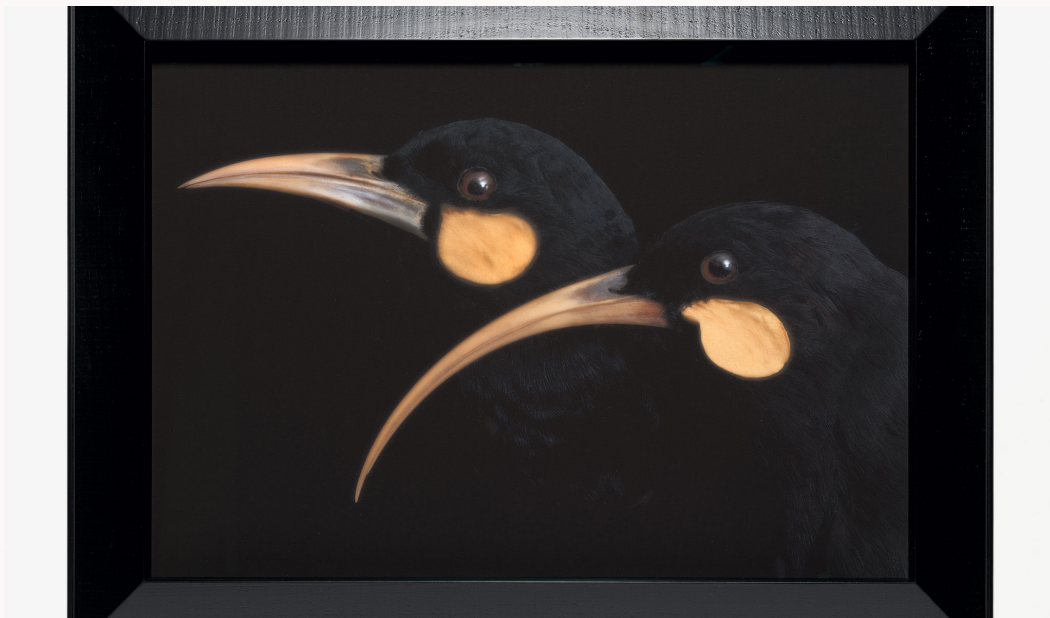
Fiona Pardington The Children of Punaweko 2025 Pigment inks on Hahnemühle Photo Rag