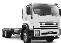
Isuzu FVZ 260-300