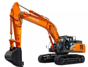
Hitachi ZX350LC-5 33t Excavator