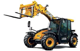
JCB 525-60 2.5t Telehandler