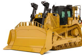
Caterpillar CAT D8T 40t Crawler Dozer

We stock leading brands including Caterpillar, Hitachi, Hamm, John Deere, Komatsu and Isuzu to give our clients access to the highest-quality and most reliable equipment.