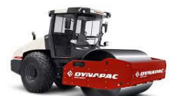
Dynapac CA1500D 8.5t Smooth Drum Roller