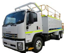
Isuzu FVZ 260-300