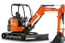
Kubota U35-4 3.7t Excavator