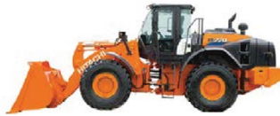
Hitachi ZW220 18t Loader