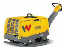
Wacker Neuson DPU110