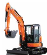
Kubota U55-4 5.5t Excavator