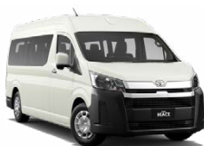
Toyota HiAce Commuter Bus