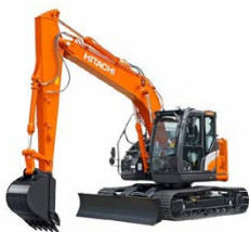
Hitachi ZX135US-5B 14t Excavator