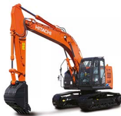
Hitachi ZX225US-5 24t Excavator