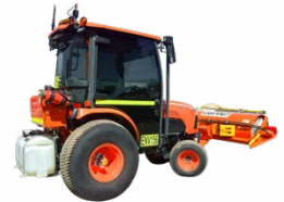
Kubota B3150 HDCC Road Sweeper