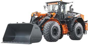
Hitachi ZW310 25t Loader