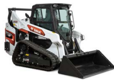
Bobcat T66 Track Loader