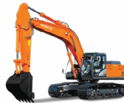
Hitachi ZX360LC-5 35t Excavator