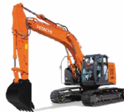
Hitachi ZH210-5 21t Excavator