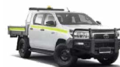
Toyota HiLux Ute