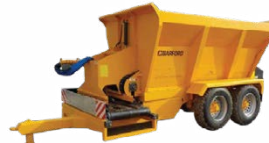
Barford 750I Sand Conveyor Trailer