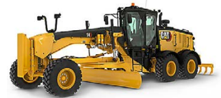
Caterpillar CAT 14M 26t Grader