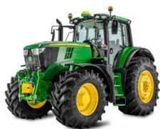
John Deere 6195M