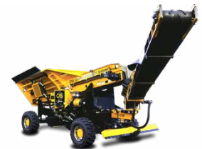
CAS AT7 15t Remote Control Slinger