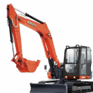
Kubota KX080-3S 8.3t Excavator