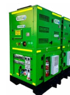
Globe Power HAC15