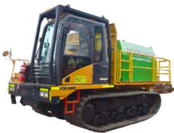
Morooka MST-2200 14t Tracked Dumper