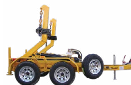
Belco Cable Trailers