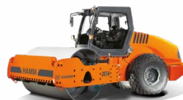
Hamm 3516 16t Roller