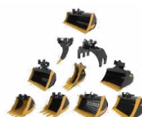
Excavator Attachments Attachments