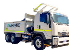
Isuzu FYH 260-300