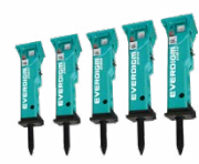
Everdigm Rock Breakers Attachments