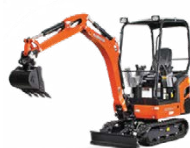
Kubota U17-3 1.7t Excavator