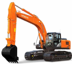
Hitachi ZX290LC-5 29t Excavator