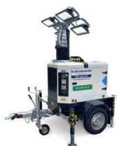
EnviroLED Urban Spec