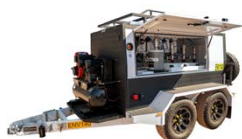
RedDirt HD Pro MineServ