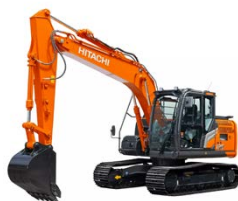
Hitachi ZX130-5 14t Excavator