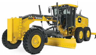
John Deere 670GP 15.5t 14-Inch Grader