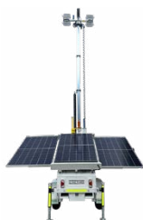
Globe Power GP65K