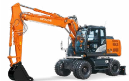
Hitachi ZX140W-5 14t Wheeled Excavator