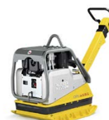
Wacker Neuson DPU6555