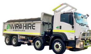
Isuzu FYH 300-350