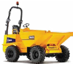
Thwaites Powerswivel 9t Dumper