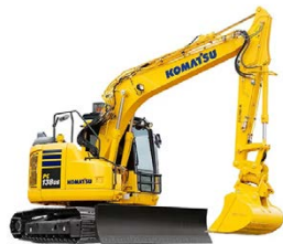
Komatsu PC138US-11 15.5t Excavator