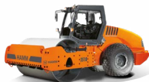
Hamm 3518-HT-P 18t Roller