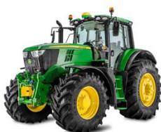
John Deere 6175M