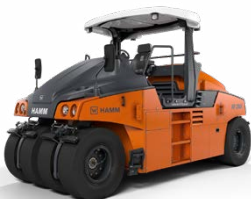
Hamm GRW280 20t Multi-Tyre Roller