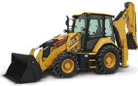
Caterpillar CAT 432 8.5t Backhoe Loader