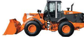
Hitachi ZW180 15t Loader