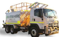
Isuzu FVZ 260-300