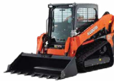
Kubota SVL75-2 4t Positrack