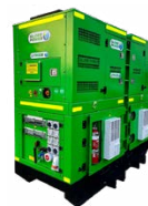
Globe Power HAC15 Hybrid Generators