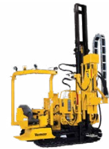
Vermeer PD10 Pile Driver