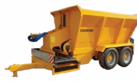
Barford 750I Sand Conveyor Trailer