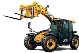
JCB 525-60 2.5t Telehandler