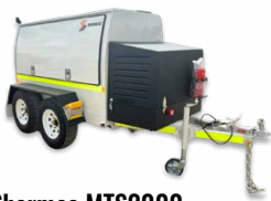
Shermac MTS2000 Service Trailer