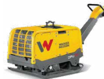
Wacker Neuson DPU110 Plate Compactor