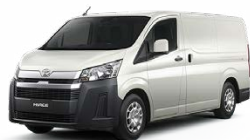
Toyota HiAce Commuter Bus Mine Spec Vehicles