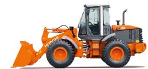
Hitachi ZW150 12t Loader