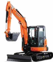
Kubota U55-4 5.5t Excavator