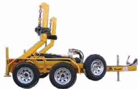
Belco Cable Trailers 2.5 and 10t Trailers