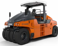
Hamm GRW280 20t Multi-Tyre Roller