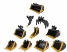
Excavator Attachments Attachments