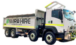
Isuzu FYH 300-350 8x4 12.5t Tipper