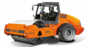
Hamm 3516 16t Roller