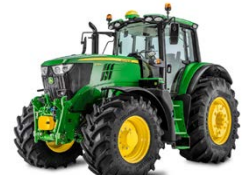
John Deere 6175M Tractor