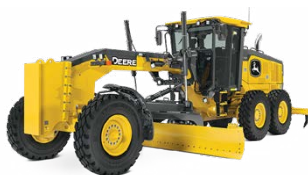
John Deere 670GP 15.5t 14-Inch Grader