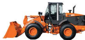
Hitachi ZW180 15t Loader