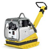
Wacker Neuson DPU6555 Plate Compactor