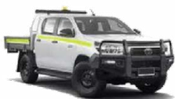
Toyota HiLux Ute Mine Spec Vehicles