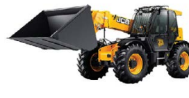
JCB 541-70 4t Telehandler