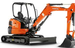
Kubota U35-4 3.7t Excavator