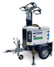
EnviroLED Urban Spec Lighting Tower