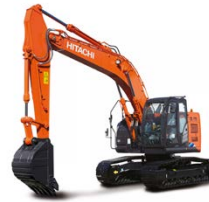
Hitachi ZX225US-5 24t Excavator