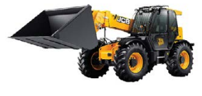
JCB 560-80 5.5t Telehandler