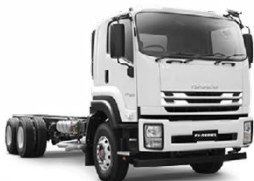
Isuzu FVZ 260-300 10t Flatbed Truck