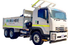
Isuzu FYH 260-300 6x4 10t Tipper