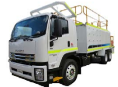
Isuzu FVZ 260-300 15t Service Truck