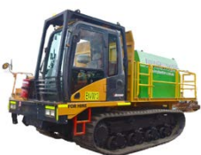
Morooka MST-2200 14t Tracked Dumper