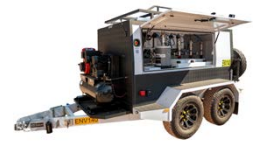
RedDirt HD Pro MineServ Service Trailer