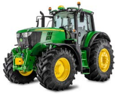
John Deere 6195M Tractor