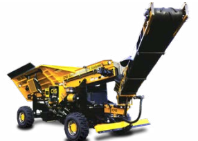
CAS AT7 15t Remote Control Slinger