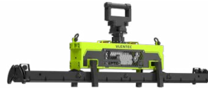
Vlentec SC250N & ED125N Vaclift