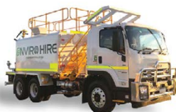
Isuzu FVZ 260-300 Water Cart