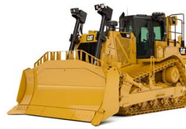
CAT D8T 40t Crawler Dozer

We stock leading brands including Caterpillar, Hitachi, Hamm, John Deere, Komatsu and Isuzu to give our clients access to the highest-quality and most reliable equipment.