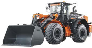
Hitachi ZW310 25t Loader