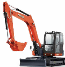
Kubota KX080-3S 8.3t Excavator