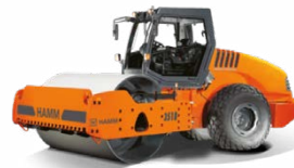
Hamm 3518-HT-P 18t Roller