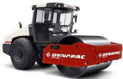
Dynapac CA1500D 8.5t Smooth Drum Roller