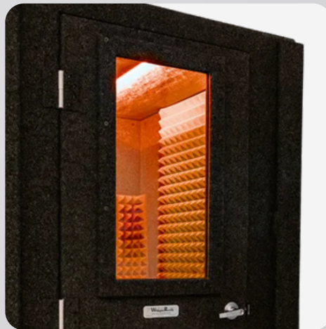
16" x 30" door window