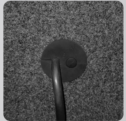
Cable passages (6)