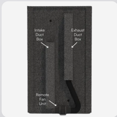
Ventilation systems (3)