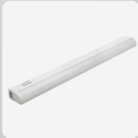
18" LED light