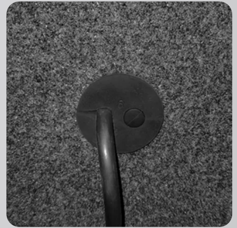
Cable passages (8)