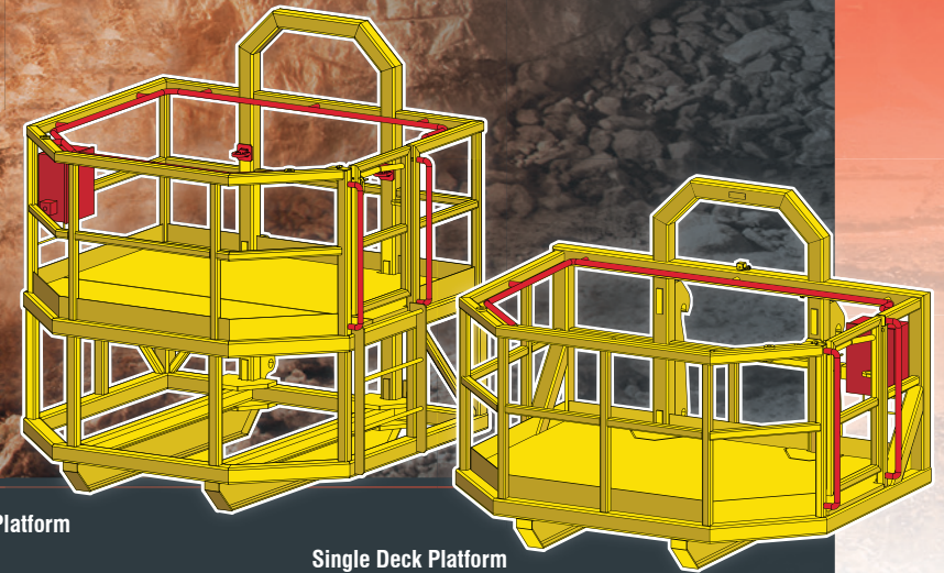
High Lift Platform