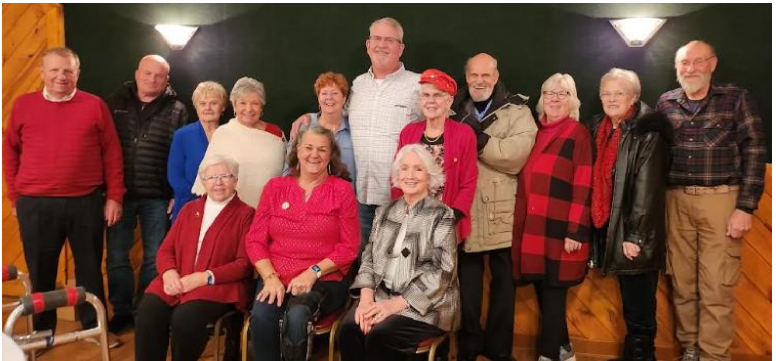
The Garrison Bay Lake Area Lions Christmas Party was a joyful gathering filled with festive fun and community spirit.”