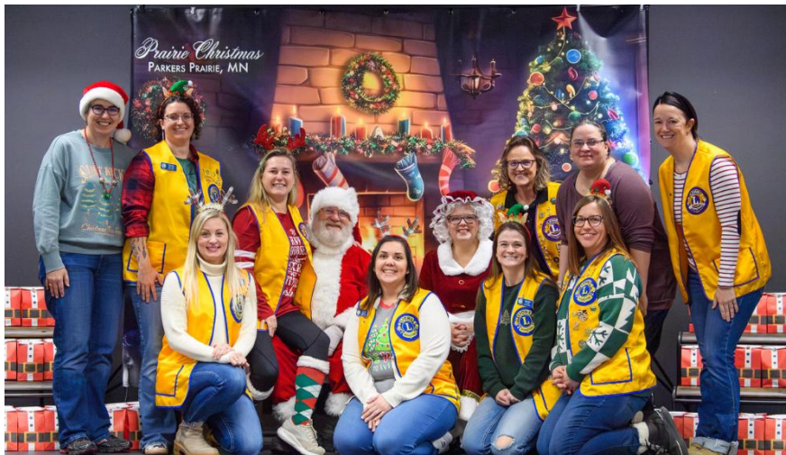
Parkers Prairie Pride of LIONS with Santa Claus ( and Mrs. Claus ) at Prairie Christmas.