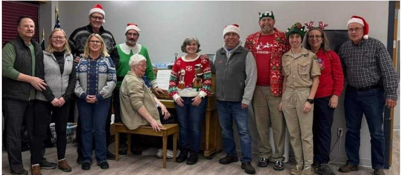
Wadena Lions Sang Christmas Carols and handed out over forty gifts to residents of Fair Oaks Lodge Nursing Home, A tradition for over 50 Years.