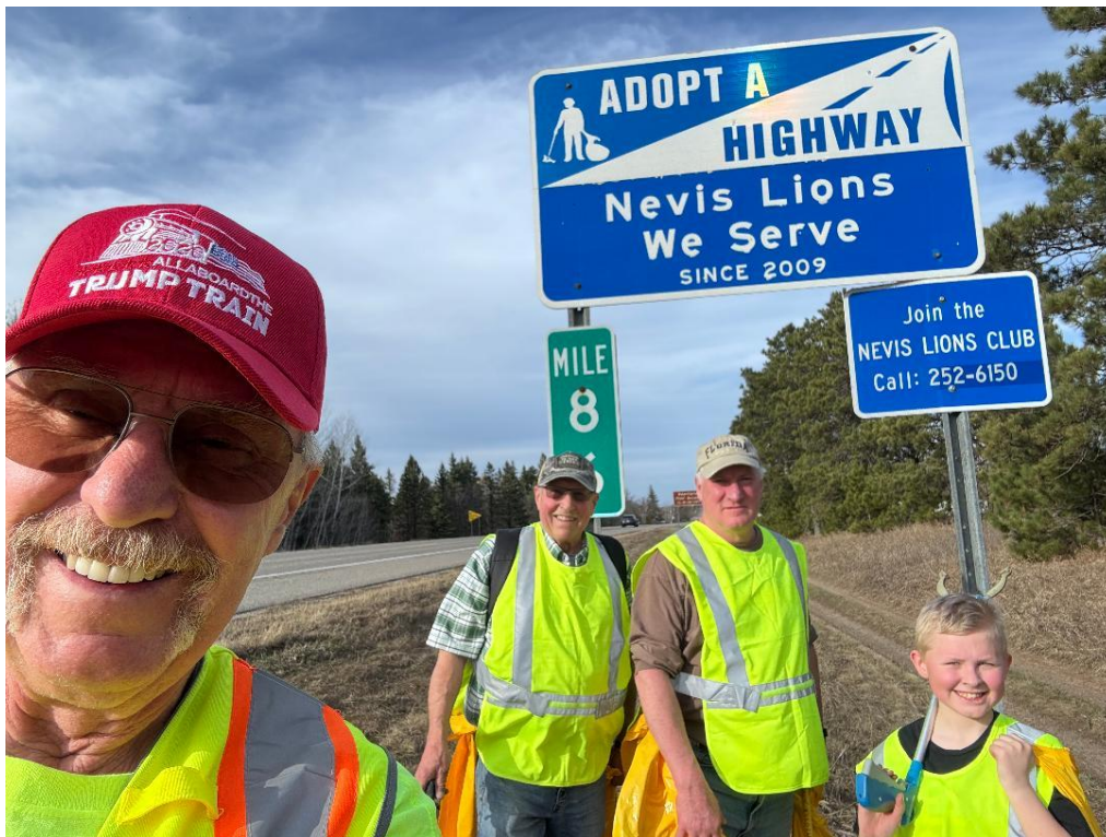
The Nevis Lions Club recently completed their spring roadside clean-up, helping keep our community looking welcoming and well-cared-for. Volunteers gathered to pick up litter along our designated stretch of roadway, working together to make a visible difference in just a few hours.