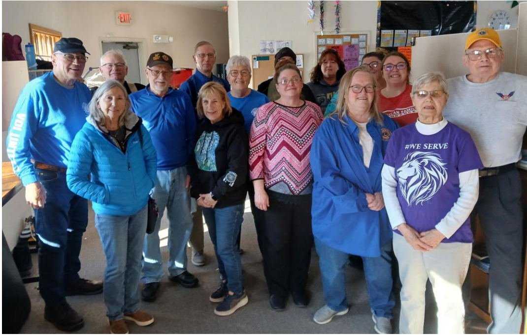
Park Rapids Lions — Food Angels in Action 🍷 Lions teamed up to pack weekend meals for local students, making sure no child goes hungry.