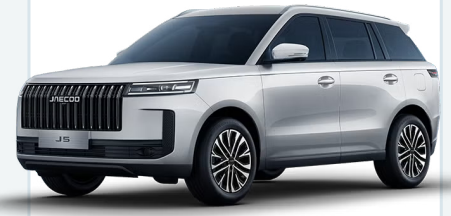
Jaecoo J5 Track