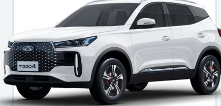
Chery Tiggo 4