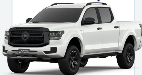
GWM Cannon Alpha