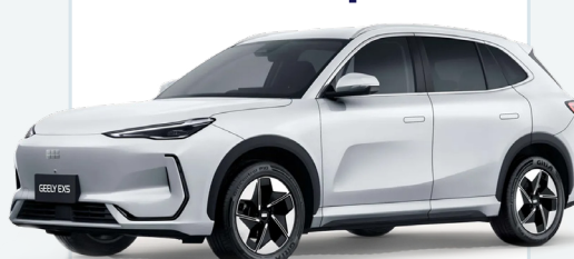
Geely EX5 Inspire