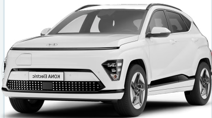
Hyundai Kona EV