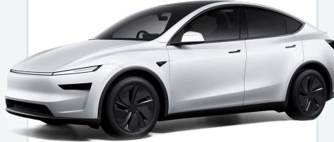
Tesla Model Y