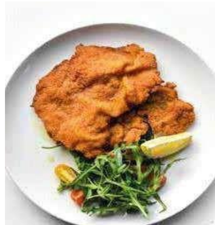
COTOLETTA DI VITELLO ALLA MILANESE

Breaded Veal "Milanese style" (boneless) with Rocket Salad and Sweet Tomatoes +58