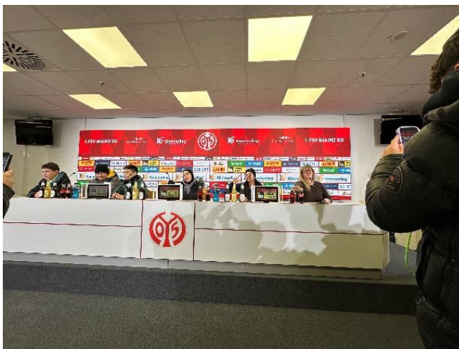
Press conference room MEWA Arena

After visiting Frankfurt Airport, we took the train to Mainz and then the tram to the MEWA Arena. There, we had a private tour where we were able to see the locker rooms, the VIP lounge, the press room, and the football field. Recently, Mainz 05 Stadium decided to become more sustainable. They chose to offer more vegan sausage instead of "regular" sausage. This shows that the stadium is also becoming more aware of sustainability.