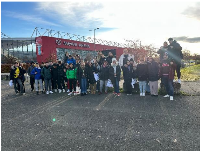
Group photo in front of the MEWA Arena