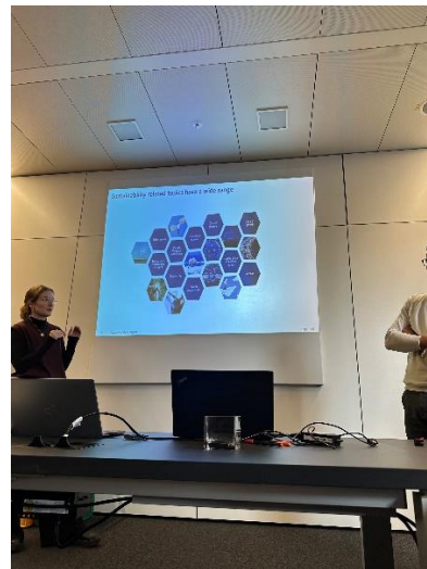
Presentation on sustainability at the airport