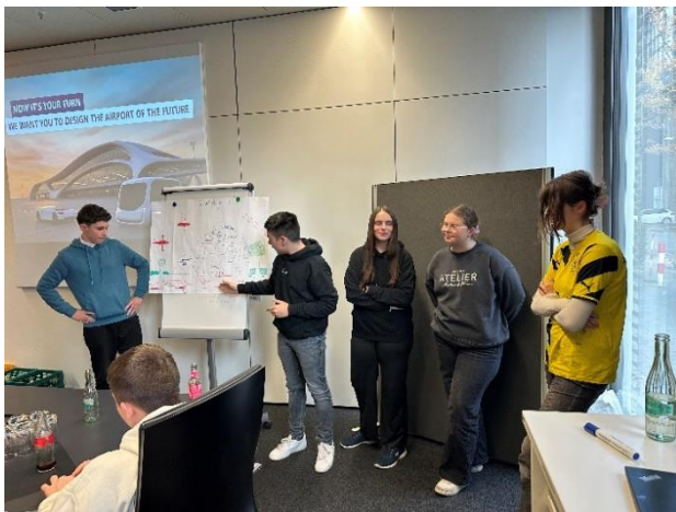
Presentation of the drawn airport

On November 21 we took the S-Bahn (public transport) to Frankfurt Airport (Fraport) at 8 AM, together with the Erasmus group and the Italian and Hungarian students. Our first stop was the airport's headquarters (HQ), where three employees from the sustainability department welcomed us. They gave a presentation on general facts and the planning for a sustainable airport. The plans for a sustainable airport include the introduction of electric vehicles and the use of green energy. Afterward, we had the opportunity to design our own airport, which we presented at the end. Towards the end of our trip at Frankfurt Airport, we had a private bus tour where various areas of the airport were shown and explained to us.