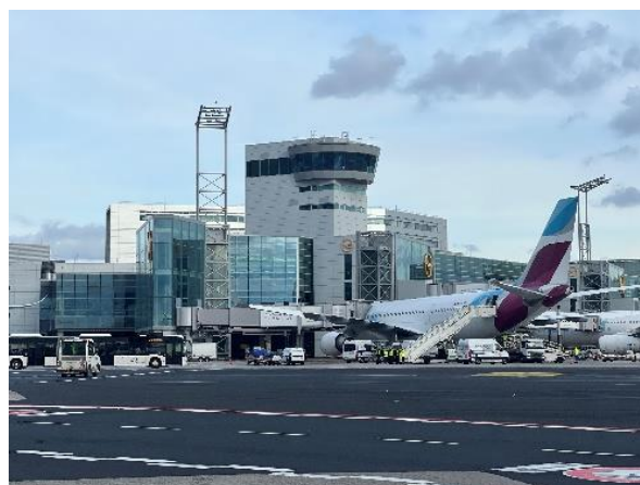
Preliminary view of Frankfurt Airport