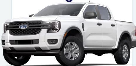
Ford Ranger XL

Make your tax work harder for you. Calculate your savings and get started with the QR Code below.