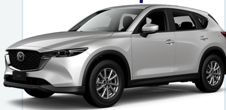
Mazda CX-5 Sport