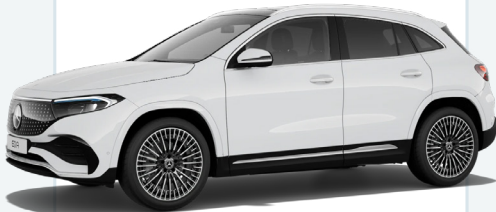
Mercedes-Benz EQ A250+