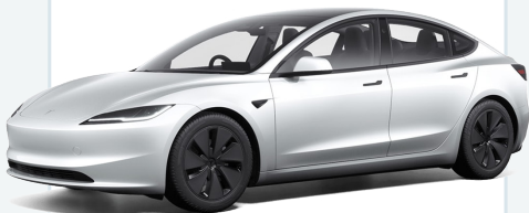
Tesla Model 3

Take advantage of the huge tax incentives that make EV's a no-brainer. Calculate your savings and get started with the QR Code below.