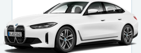
BMW i4 eDrive35