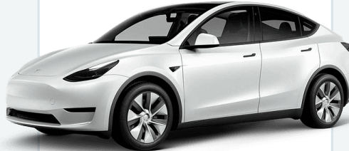
Tesla Model Y