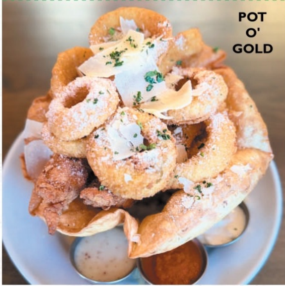
POT O' GOLD