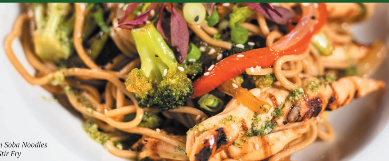
Chicken Soba Noodles Asian Stir Fry

With Grilled Tofu 23 / Grilled Chicken 24 / Grilled Shrimp 26 Gluten Free Noodles + 3