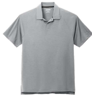
OGIO® MOTION POLO 6.5-ounce, 84/10/6 poly/rayon/spandex OG152 | XS-4XL | 5 colors