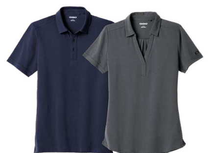
OGIO® LIMIT POLOS 5.6-ounce, 58/38/4 cotton/polyester/spandex OG138 | XS-4XL | 6 colors LOG138 | Women's XS-4XL | 6 colors