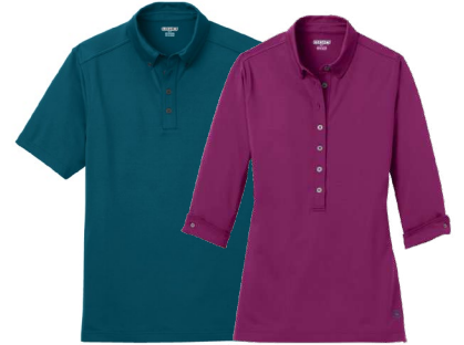
OGIO® GAUGE POLOS 5.9-ounce, 94/6 polyester/spandex OG122 | XS-4XL | 5 colors LOG122 | Women's XS-4XL | 6 colors