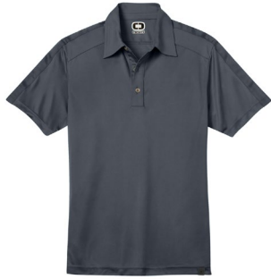
OGIO® HYBRID POLO 4.9-ounce, 100% polyester OG109 | XS-4XL | 3 colors