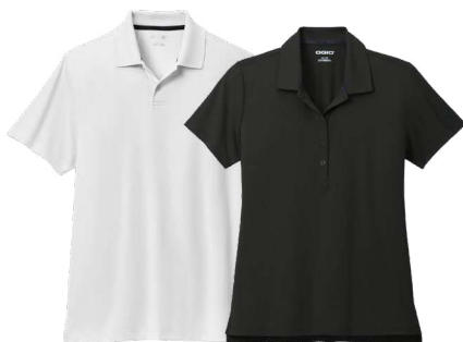
OGIO® REGAIN POLOS 5-ounce, 88/12 recycled poly/recycled spandex OG170 | XS-4XL | 9 colors LOG170 | Women's XS-4XL | 8 colors