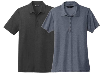
TRAVISMATHEW OCEANSIDE HEATHER POLOS 4.4-ounce, 57/43 cotton/polyester 4.1-ounce, 57/43 cotton/polyester (Women's) TM1MY404 | S-3XL | 3 colors TM1WW002 | Women's S-2XL | 6 colors