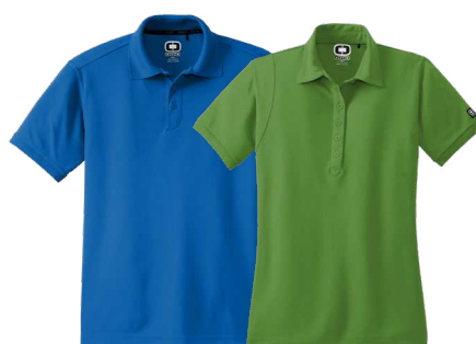
OGIO® CALIBER2.0 POLO 5-ounce, 100% polyester pique OG101 | XS-4XL | 13 colors