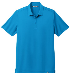
TRAVISMATHEW CABANA SOLID POLO 4.1-ounce, 96/4 recycled polyester/spandex TM1MAA370 | S-3XL | 7 colors