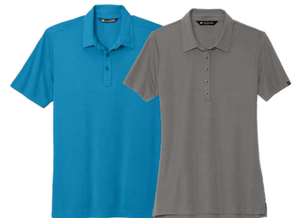
TRAVISMATHEW OCEANSIDE SOLID POLOS 4.6-ounce, 51/49 cotton/polyester TM1MU411 | S-3XL | 6 colors TM1WW001 | Women's S-2XL | 5 colors