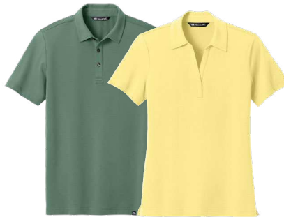
TRAVISMATHEW GLENVIEW SOLID POLOS 4.1-ounce, 74/19/7 recycled polyester/cotton/spandex TMA41461 | S-3XL | 7 colors TM1LF071 | Women's S-2XL | 5 colors