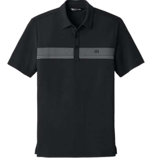
TRAVISMATHEW GLENVIEW STRIPE POLO 4.1-ounce, 74/19/7 recycled polyester/cotton/spandex TMA41462 | S-3XL | 4 colors