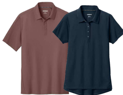
OGIO® ENVISION POLOS 4.9-ounce, 88/12 nylon/spandex micropique with stay-cool wicking technology OG154 | XS-4XL | 6 colors LOG154 | Women's XS-4XL | 5 colors