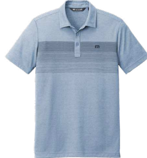
TRAVISMATHEW COASTAL CHEST STRIPE POLO 4.4-ounce, 58/42 cotton/polyester TM1MY402 | S-3XL | 4 colors