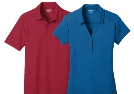
OGIO® FRAMEWORK POLOS 4.2-ounce, 100% polyester pique OG125 | XS-4XL | 4 colors LOG125 | Women's XS-4XL | 4 colors