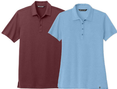
TRAVISMATHEW SUNNYVALE POLOS 5-ounce, 64/36 pima cotton/polyester TM1MAA369 | S-3XL | 6 colors TM1LD005 | Women's S-2XL | 5 colors