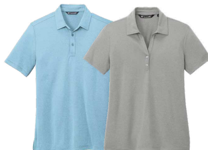
TRAVISMATHEW COTO PERFORMANCE POLOS 4.1-ounce, 100% polyester TM1MU410 | S-3XL | 10 colors TM1WX002 | Women's S-2XL | 5 colors