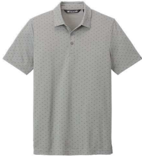
TRAVISMATHEW OCEANSIDE GEO POLO 4.4-ounce, 58/42 cotton/polyester TM1MY403 | S-3XL | 2 colors