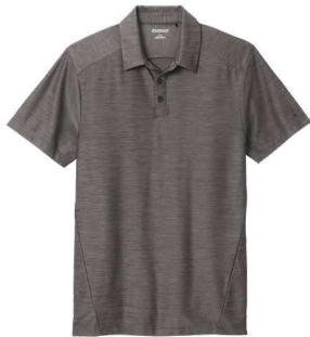
OGIO® SLATE POLO 5.2-ounce, 90/10 polyester/spandex OG143 | XS-4XL | 3 colors