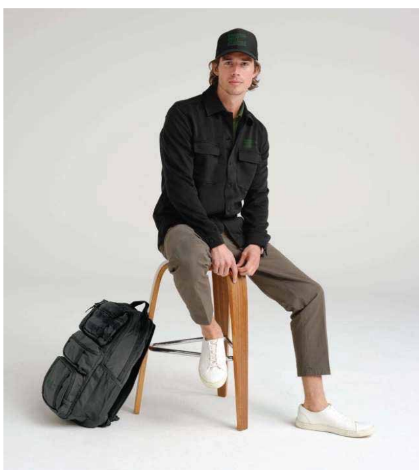
OGIO Utilitarian Modular Pack 91018 2 colors