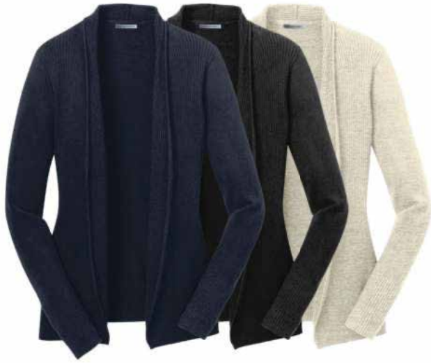
PORT AUTHORITY Ladies Open Front Cardigan Sweater LSW289 Women's Sizes: XS-4XL | 4 colors