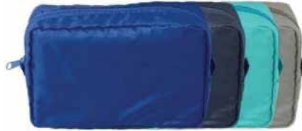
PORT AUTHORITY Stash Dimensional Pouch BG916 6 colors