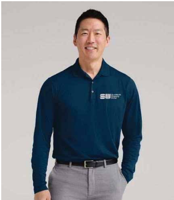
NIKE Dri-FIT Micro Pique 2.0 Long Sleeve Polo NKDC2104 Adult Sizes: XS-4XL | 7 colors