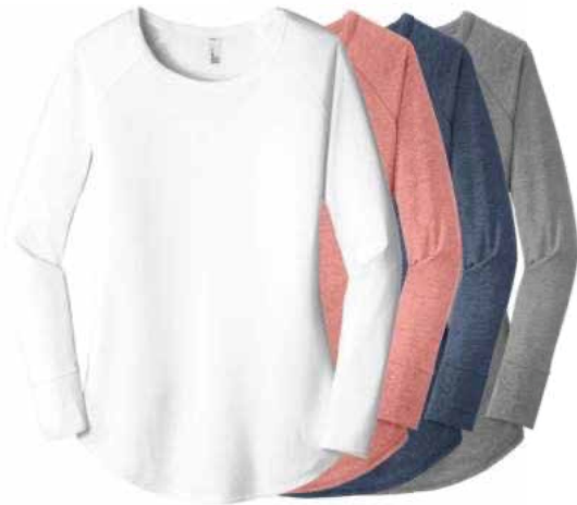
DISTRICT Women's Perfect Tri Long Sleeve Tunic Tee DT132L Women's Sizes: XS-4XL | 5 colors

Uplift the whole team with outfits that speak to a cohesive vision, a laid-back attitude and a clear focus on accomplishing great work together.