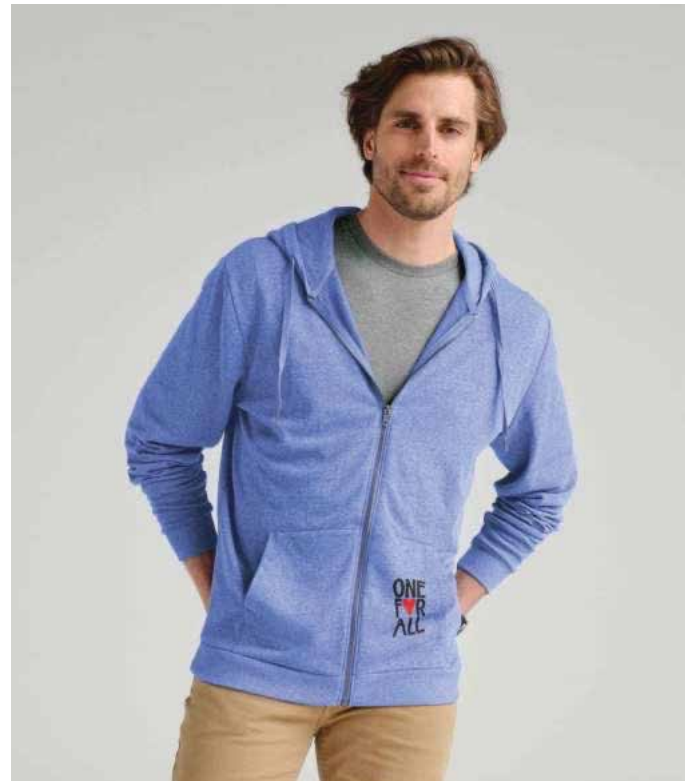
DISTRICT Perfect Tri Fleece Full-Zip Hoodie DT1302 Adult Sizes: XS-4XL | 6 colors