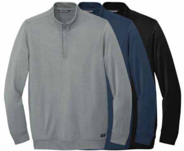
TRAVIS MATHEW Newport 1/4-Zip Fleece TM1MU419 Adult Sizes: S-3XL | 3 colors