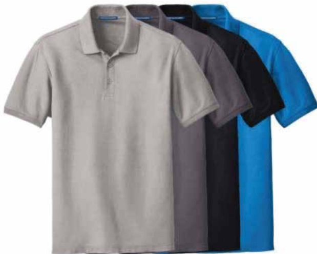
PORT AUTHORITY Core Classic Pique Polo K100 Adult Sizes: XS-6XL | 12 colors