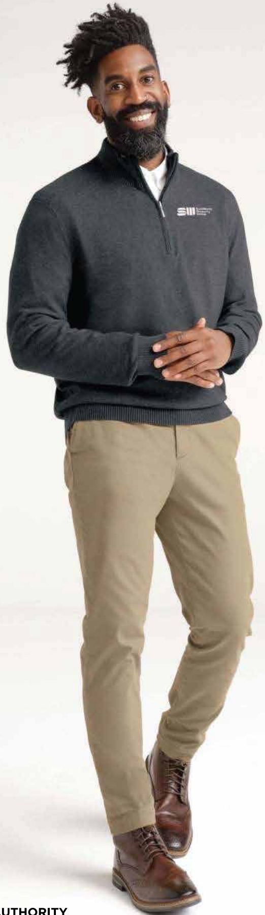
PORT AUTHORITY 1/2-Zip Sweater SW290 Adult Sizes: XS-4XL | 3 colors Worn with BB18002