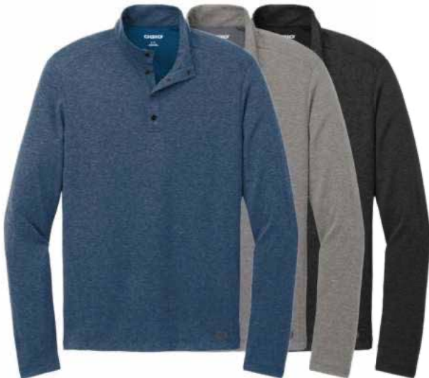
OGIO Command 1/4-Snap OG151 Adult Sizes: XS-4XL | 3 colors