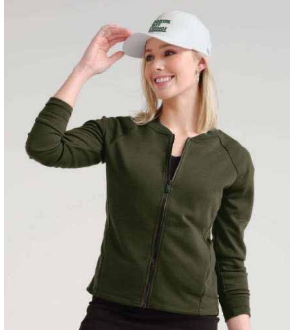
MERCER + METTLE Women's Double-Knit Bomber MM3001 Women's Sizes: XS-4XL | 4 colors Worn with TM1MU426

One size rarely fits all. A modern look represents a cohesive group that gives each member of the team the room to be themselves.