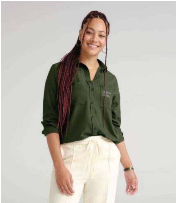
MERCER + METTLE Women's Stretch Crepe Long Sleeve Camp Blouse MM2013 Women's Sizes: XS-4XL | 4 colors