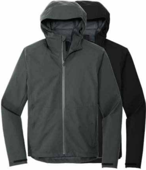
MERCER + METTLE Waterproof Rain Shell MM7000 Adult Sizes: XS-4XL | 2 colors