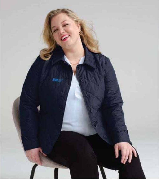
BROOKS BROTHERS Women's Quilted Jacket BB18601 Women's Sizes: XS-4XL | 2 colors Worn with BB18009