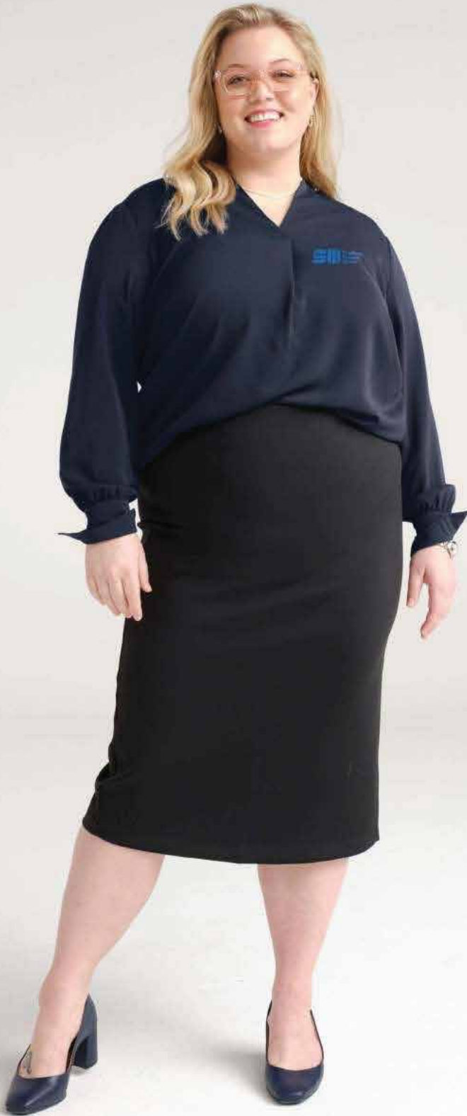
BROOKS BROTHERS Women's Open-Neck Satin Blouse BB18009 Women's Sizes: XS-4XL | 4 colors

Buttoned-up should not mean boring. A true classic look brings the team together with a sense of professionalism and pride.