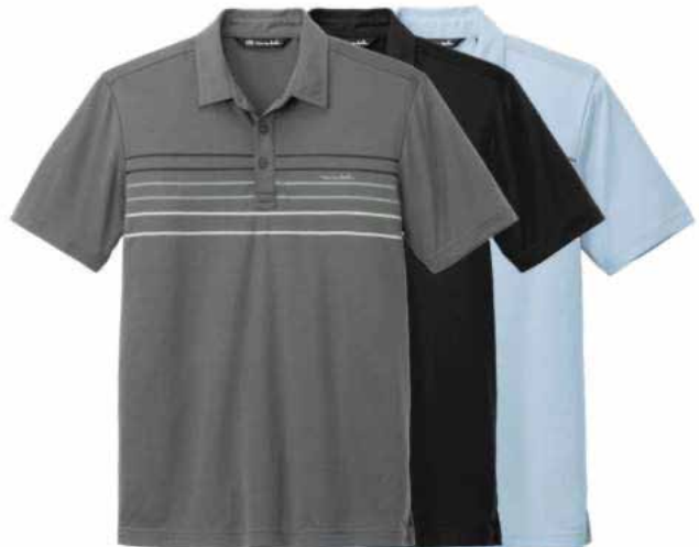
TRAVISMATHEW Coto Performance Chest Stripe Polo TM1MY400 Adult Sizes: S-3XL | 3 colors