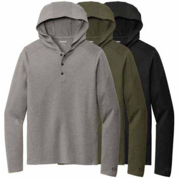
OGIO Luuma Flex Hooded Henley OG826 Adult Sizes: XS-4XL | 3 colors