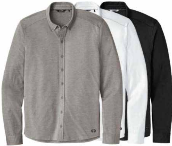
OGIO Code Stretch Long Sleeve Button-Up OG145 Adult Sizes: XS-4XL | 3 colors