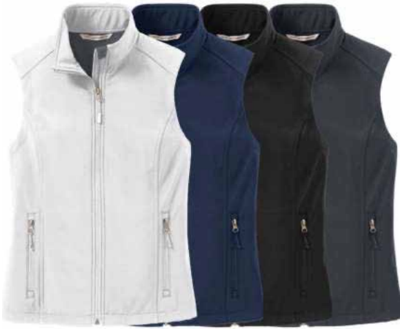
PORT AUTHORITY Ladies Core Soft Shell Vest L325 Women's Sizes: XS-4XL | 5 colors