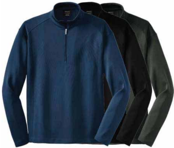
NIKE Sport Cover-Up 400099 Adult Sizes: XS-4XL | 3 colors