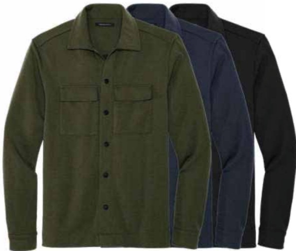
MERCER + METTLE Double-Knit Snap Front Jacket MM3004 Adult Sizes: XS-4XL | 3 colors