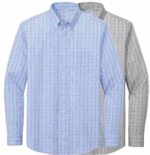
BROOKS BROTHERS Wrinkle Free Stretch Patterned Shirt BB18008 Adult Sizes: XS-4XL | 2 colors

Buttoned-up should not mean boring. A true classic look brings the team together with a sense of professionalism and pride.