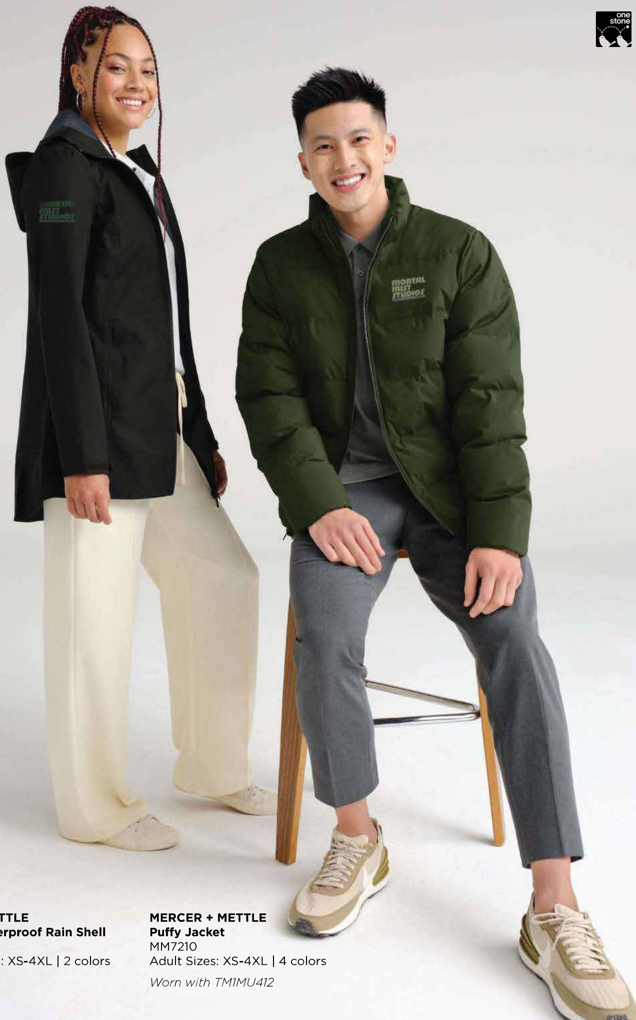
MERCER + METTLE Women's Waterproof Rain Shell MM7001 Women's Sizes: XS-4XL | 2 colors