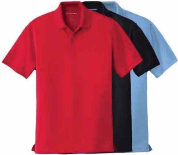
PORT AUTHORITY Dry Zone UV Micro-Mesh Polo K110 Adult Sizes: XS-6XL | 16 colors