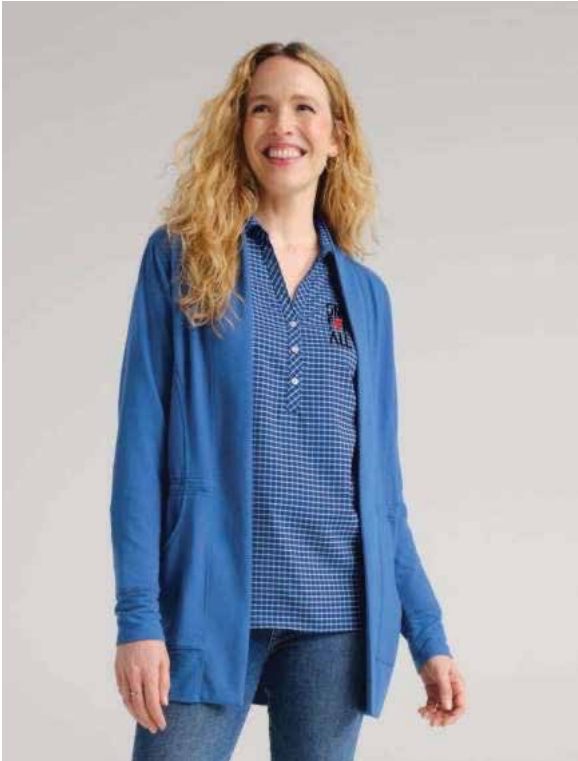
PORT AUTHORITY Ladies Microterry Cardigan LK825 Women's Sizes: XS-4XL | 4 colors Worn with LW680