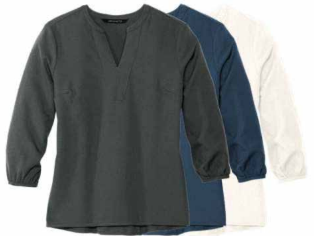
MERCER + METTLE Women's Stretch Crepe 3/4-Sleeve Blouse MM2011 Women's Sizes: XS-4XL | 5 colors