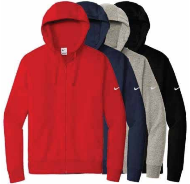
NIKE Club Fleece Sleeve Swoosh Full-Zip Hoodie NKDRI513 Adult Sizes: XS-4XL | 6 colors