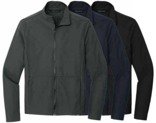
MERCER + METTLE Faille Soft Shell MM7100 Adult Sizes: XS-4XL | 3 colors