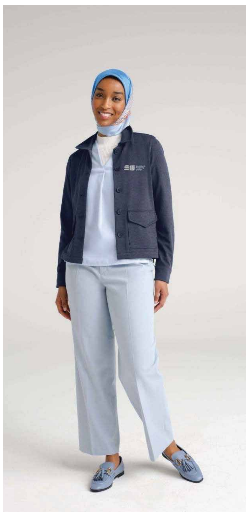
BROOKS BROTHERS Women's Mid-Layer Stretch Button Jacket BB18205 Women's Sizes: XS-4XL | 3 colors Worn with BB18009