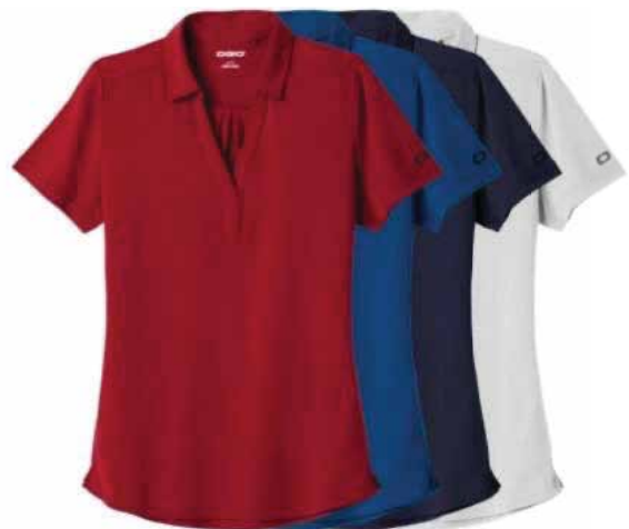
OGIO Ladies Limit Polo LOG138 Women's Sizes: XS-4XL | 7 colors