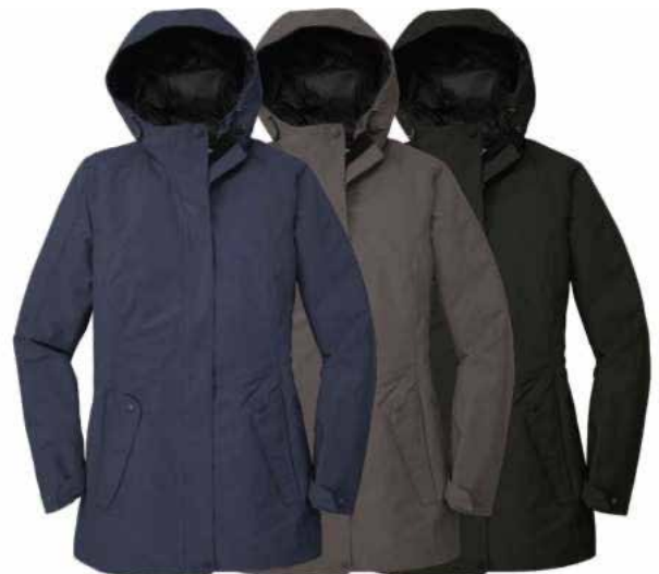
PORT AUTHORITY Ladies Collective Outer Shell Jacket L900 Women's Sizes: XS-4XL | 4 colors