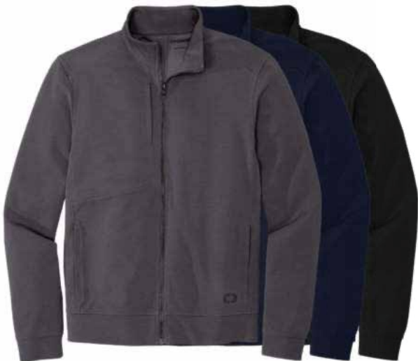
OGIO Hinge Full-Zip OG820 Adult Sizes: XS-4XL | 3 colors