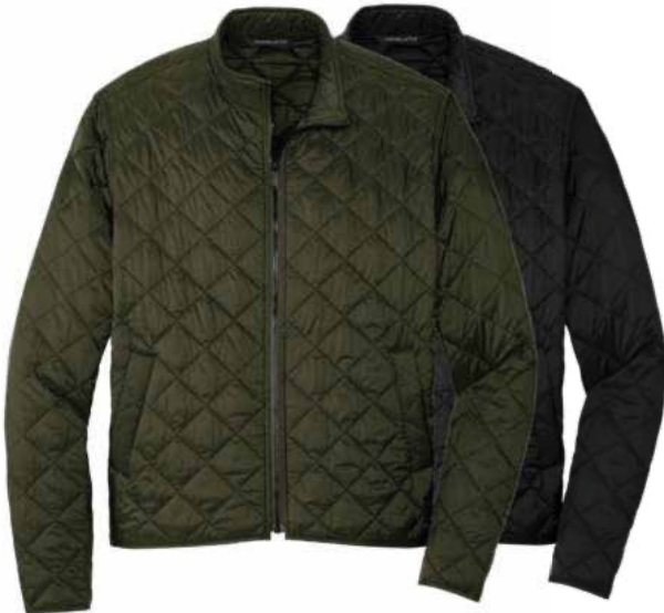
MERCER + METTLE Quilted Full-Zip Jacket MM7200 Adult Sizes: XS-3XL | 2 colors