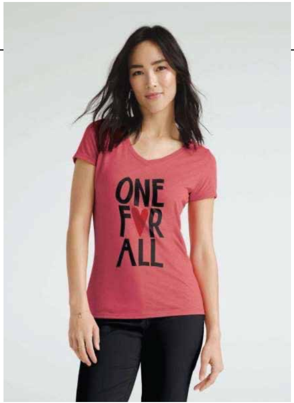
DISTRICT Women's Perfect Tri V-Neck Tee DM1350L Women's Sizes: XS-4XL | 23 colors