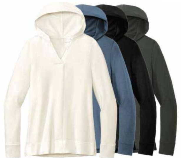
PORT AUTHORITY Ladies Microterry Pullover Hoodie LK826 Women's Sizes: XS-4XL | 4 colors