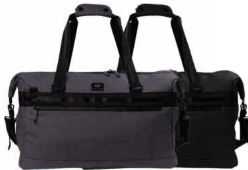
OGIO Commuter Duffel 411098 2 colors