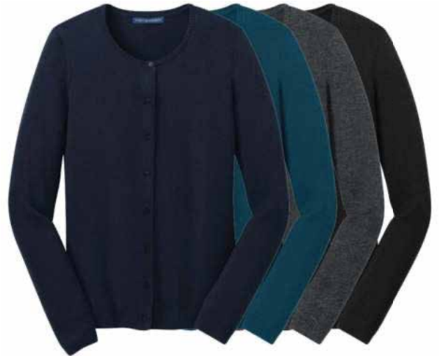
PORT AUTHORITY Ladies Cardigan Sweater LSW287 Women's Sizes: XS-4XL | 3 colors