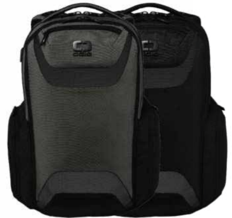
OGIO Connected Pack 91008 2 colors