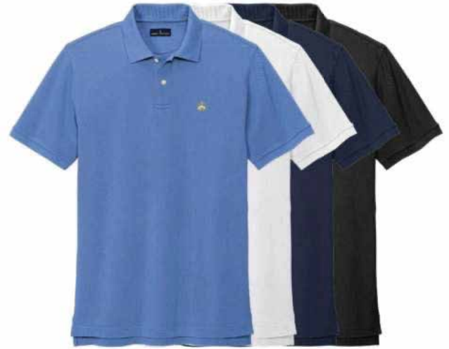
BROOKS BROTHERS Pima Cotton Pique Polo BB18200 Adult Sizes: XS-4XL | 6 colors