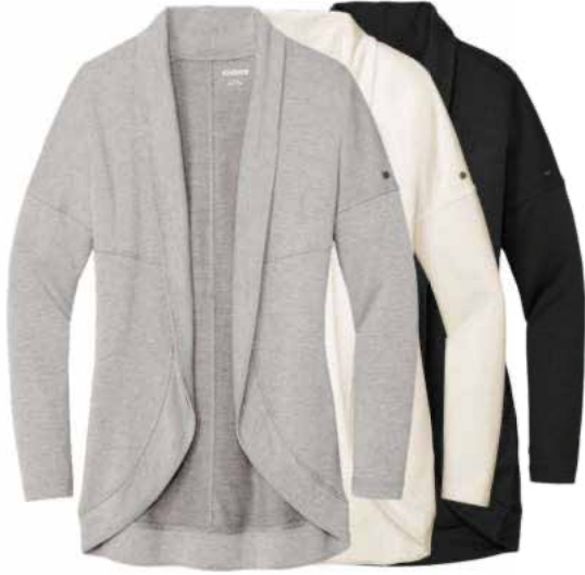
OGIO Ladies Luuma Cocoon Fleece LOG811 Women's Sizes: XS-4XL | 3 colors