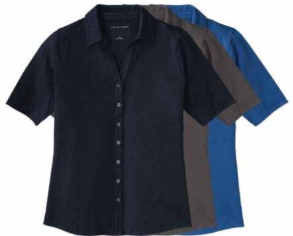
PORT AUTHORITY Ladies City Stretch Top LK682 Women's Sizes: XS-4XL | 5 colors