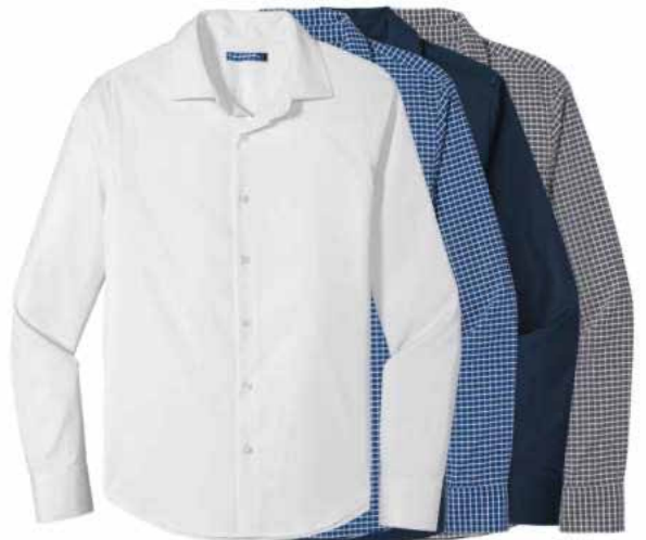
PORT AUTHORITY City Stretch Shirt W680 Adult Sizes: XS-4XL | 5 colors