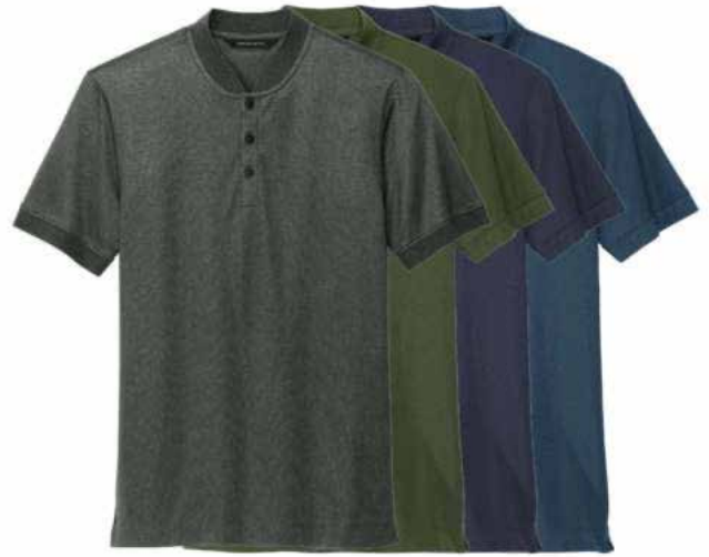
MERCER + METTLE Stretch Pique Henley MM1008 Adult Sizes: XS-4XL | 7 colors