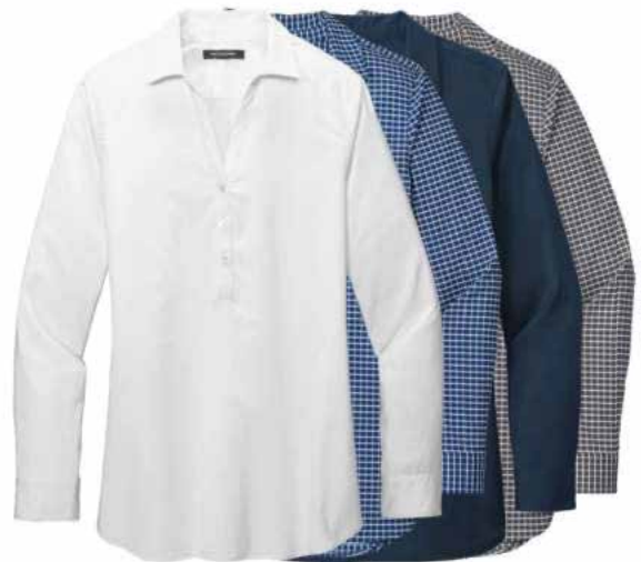
PORT AUTHORITY Ladies City Stretch Tunic LW680 Women's Sizes: XS-4XL | 5 colors