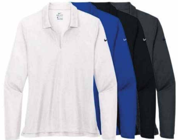
NIKE Ladies Dri-FIT Micro Pique 2.0 Long Sleeve Polo NKDC2105 Women's Sizes: S-2XL | 7 colors