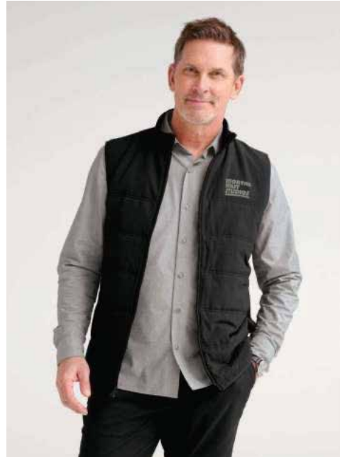
TRAVIS MATHEW Cold Bay Vest TM1MW453 Adult Sizes: S-3XL | 2 colors Worn with MM2000