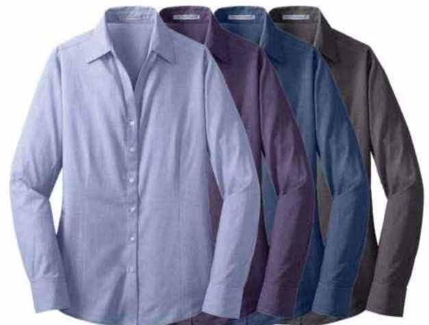
PORT AUTHORITY Ladies Crosshatch Easy Care Shirt L640 Women's Sizes: XS-4XL | 4 colors