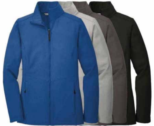
PORT AUTHORITY Ladies Collective Soft Shell Jacket L901 Women's Sizes: XS-4XL | 5 colors