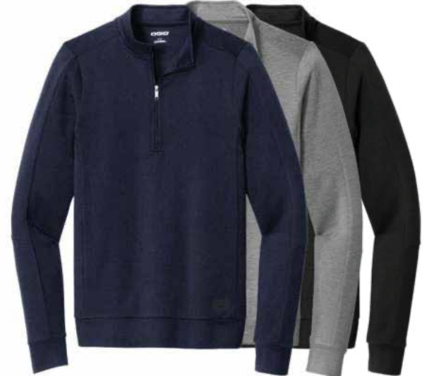
OGIO Luuma 1/2-Zip Fleece OG813 Adult Sizes: XS-4XL | 3 colors