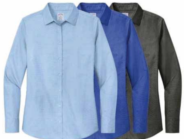
BROOKS BROTHERS Wrinkle Free Women's Stretch Nailhead Shirt BB18003 Women's Sizes: XS-4XL | 6 colors