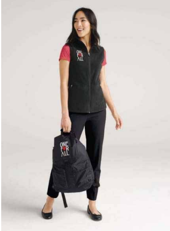
OGIO Evolution Pack 91015 4 colors