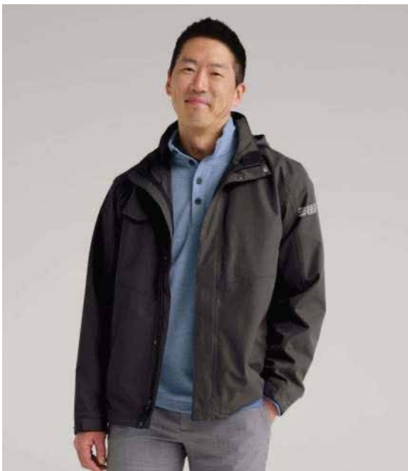
PORT AUTHORITY Collective Outer Shell Jacket J900 Adult Sizes: XS-4XL | 4 colors Worn with NKDC2104, BB18202