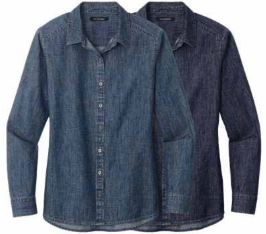
PORT AUTHORITY Ladies Long Sleeve Perfect Denim Shirt LW676 Women's Sizes: XS-4XL | 2 colors