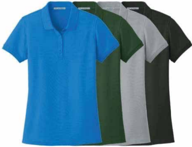
PORT AUTHORITY Ladies Core Classic Pique Polo L100 Women's Sizes: XS-6XL | 13 colors