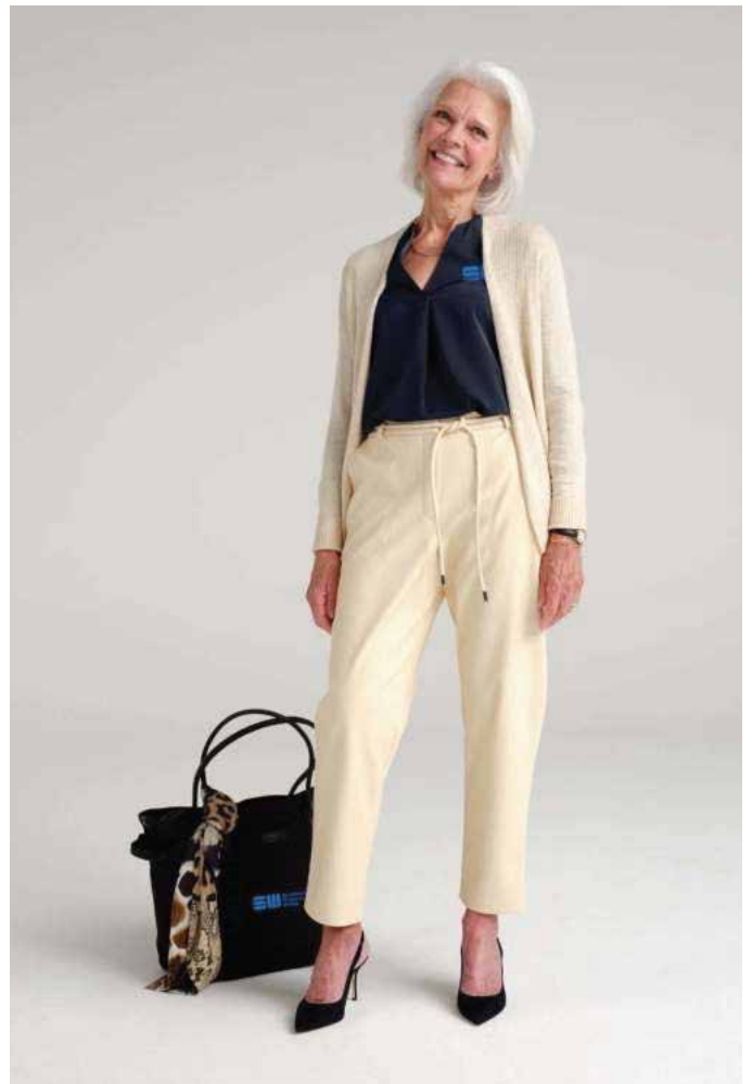
BROOKS BROTHERS Wells Laptop Tote BB18840 2 colors