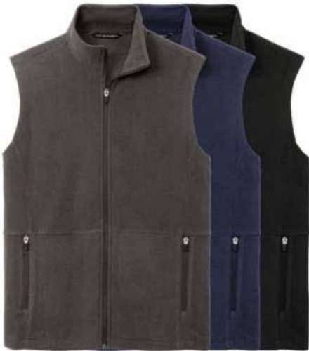
PORT AUTHORITY Accord Microfleece Vest F152 Adult Sizes: XS-4XL | 3 colors