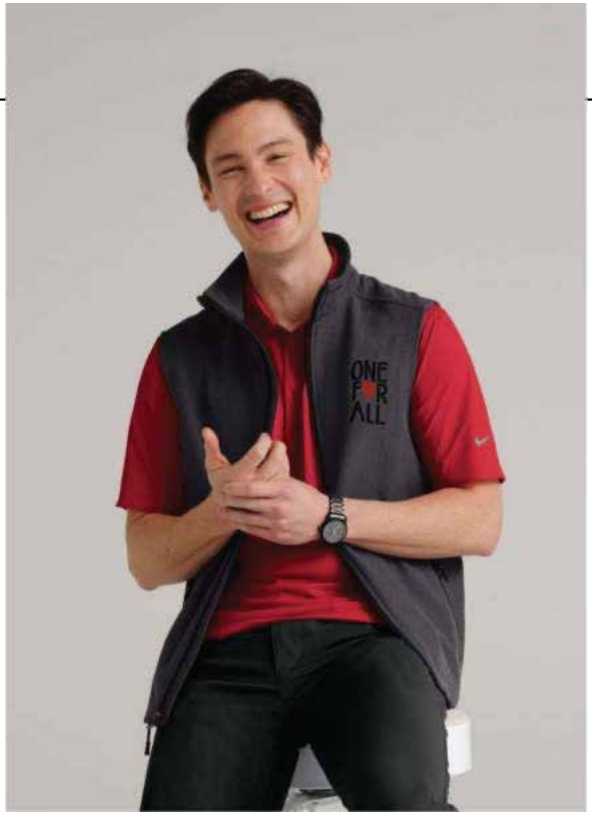
PORT AUTHORITY Core Soft Shell Vest J325 Adult Sizes: XS-4XL | 4 colors Worn with 883681