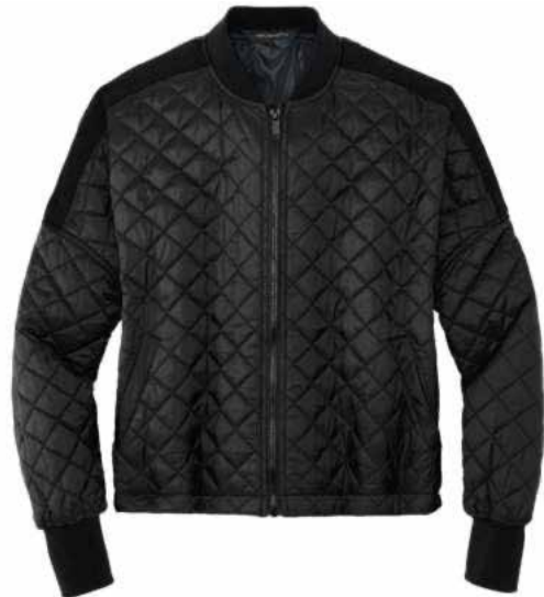
MERCER + METTLE Women's Boxy Quilted Jacket MM7201 Women's Sizes: XS-4XL | 1 color