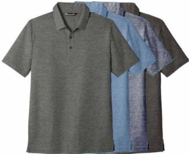
TRAVISMATHEW Oceanside Heather Polo TM1MU412 Adult Sizes: S-3XL | 8 colors