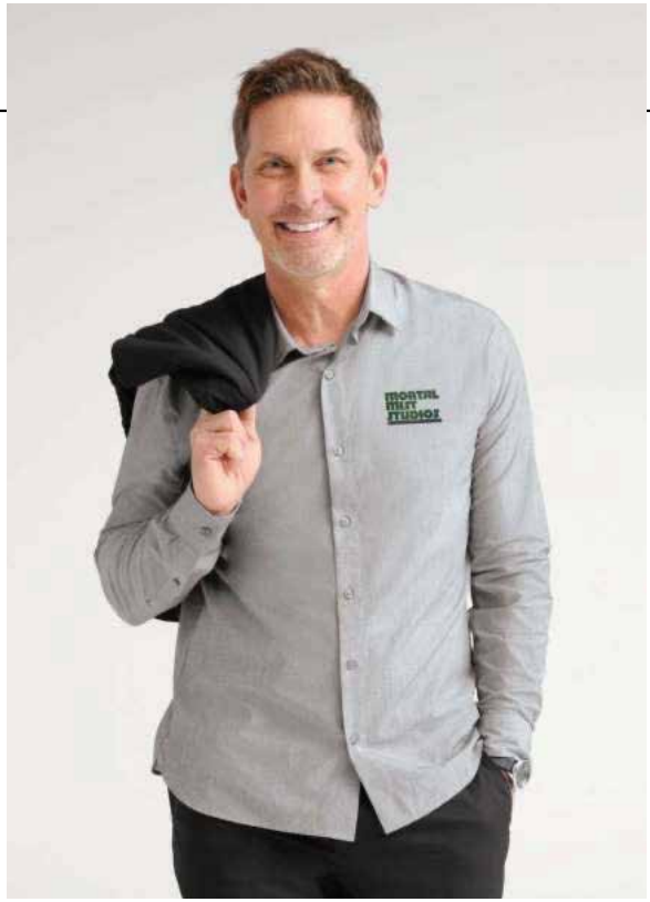
MERCER + METTLE Long Sleeve Stretch Woven Shirt MM2000 Adult Sizes: XS-4XL | 7 colors Worn with TM1MW453