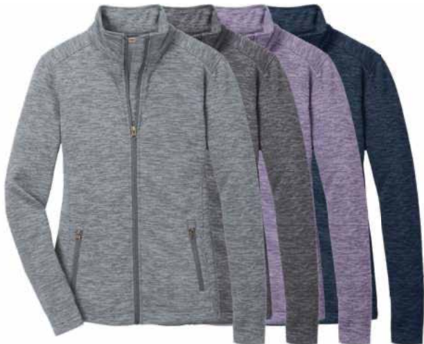
PORT AUTHORITY Ladies Digi Stripe Fleece Jacket L231 Women's Sizes: XS-4XL | 4 colors