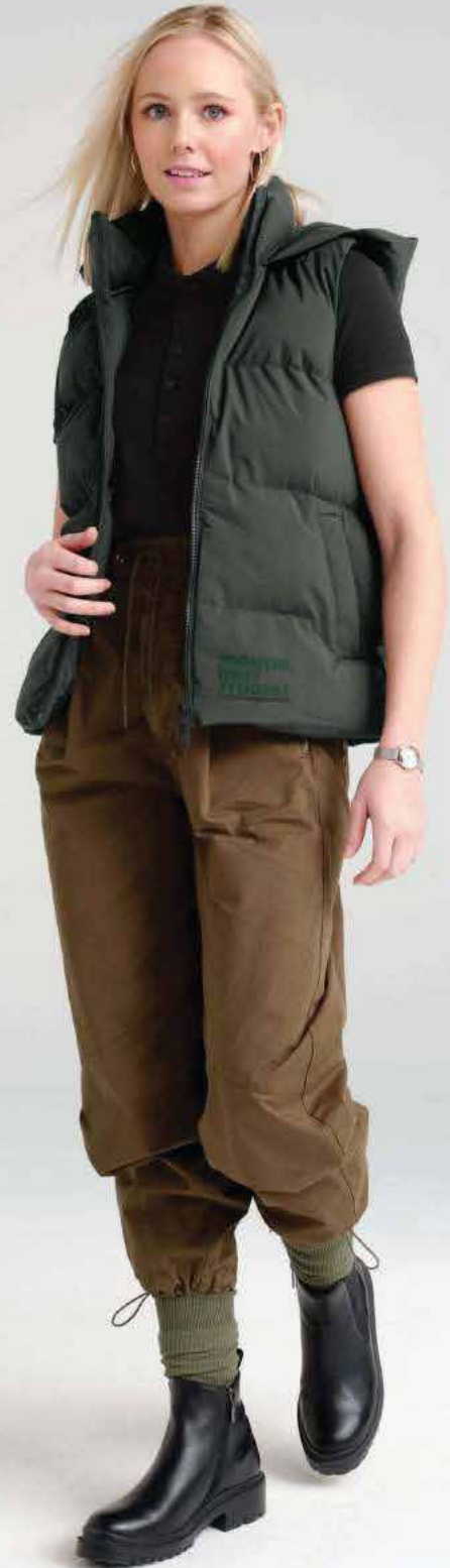
MERCER + METTLE Women's Stretch Heavyweight Pique Polo MM1001 Women's Sizes: XS-4XL | 8 colors