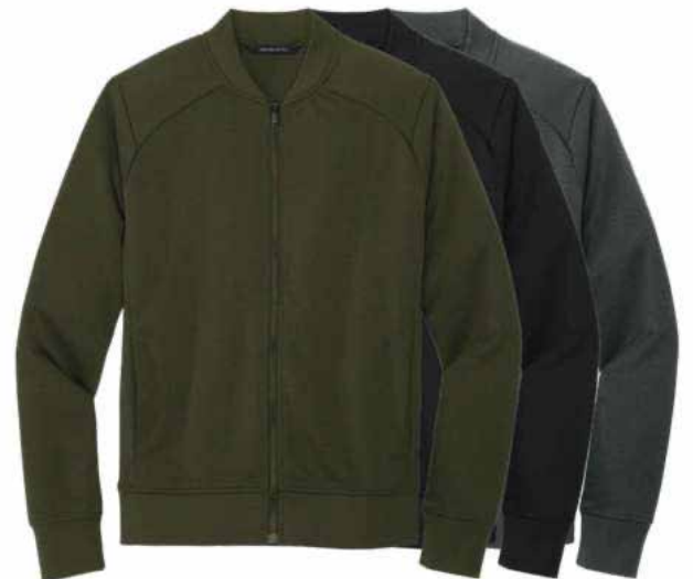
MERCER + METTLE Double-Knit Bomber MM3000 Adult Sizes: XS-4XL | 4 colors