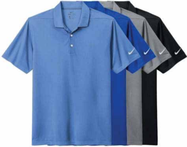
NIKE Dri-FIT Micro Pique 2.0 Polo NKDC1963 Adult Sizes: XS-4XLT | 20 colors