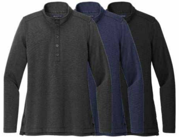
BROOKS BROTHERS Women's Mid-Layer Stretch 1/2 Button BB18203 Women's Sizes: XS-4XL | 3 colors