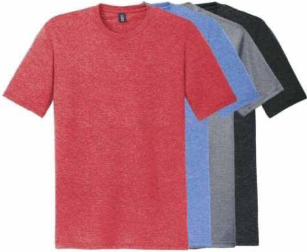
DISTRICT Perfect Tri Tee DM130 Adult Sizes: XS-4XL | 35 colors