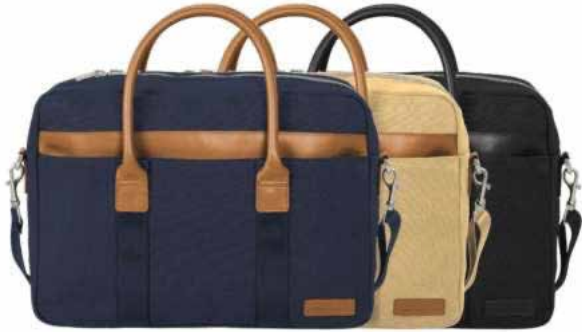
BROOKS BROTHERS Wells Briefcase BB18830 3 colors