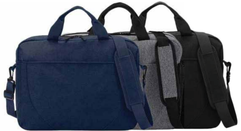
PORT AUTHORITY Access Briefcase BG318 3 colors