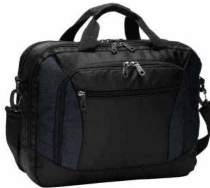
PORT AUTHORITY Commuter Brief BG307 1 color

Heat Transfer is the most effective technique for these styles