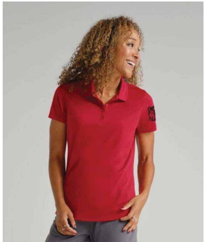
PORT AUTHORITY Ladies Dry Zone UV Micro-Mesh Polo LK110 Women's Sizes: XS-4XL | 16 colors