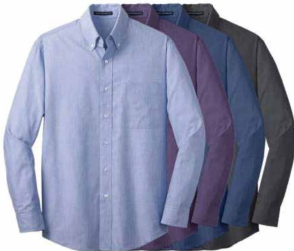
PORT AUTHORITY Crosshatch Easy Care Shirt S640 Adult Sizes: XS-4XL | 4 colors