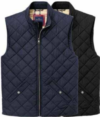
BROOKS BROTHERS Quilted Vest BB18602 Adult Sizes: XS-4XL | 2 colors