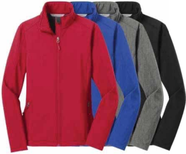
PORT AUTHORITY Ladies Core Soft Shell Jacket L317 Women's Sizes: XS-4XL | 10 colors