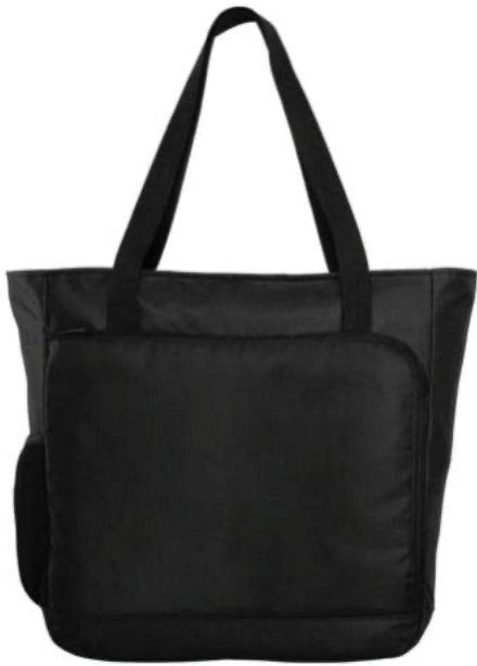
PORT AUTHORITY City Tote BG422 1 color