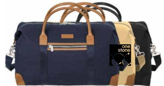
BROOKS BROTHERS Wells Duffel BB18880 3 colors