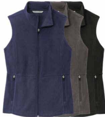
PORT AUTHORITY Ladies Accord Microfleece Vest L152 Women's Sizes: XS-4XL | 3 colors