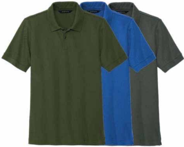
MERCER + METTLE Stretch Heavyweight Pique Polo MM1000 Adult Sizes: XS-4XL | 8 colors