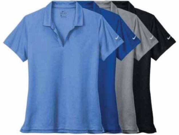
NIKE Ladies Dri-FIT Micro Pique 2.0 Polo NKDC1991 Women's Sizes: S-2XL | 20 colors