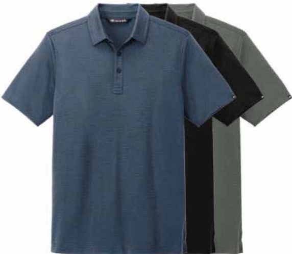
TRAVISMATHEW Bayfront Solid Polo TM1MY399 Adult Sizes: S-3XL | 4 colors