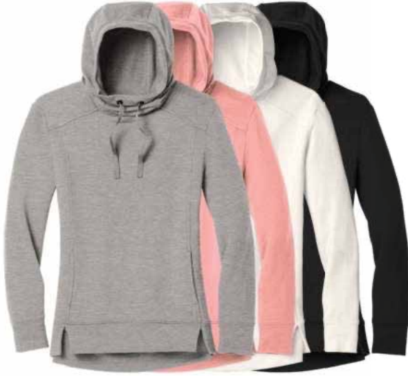
OGIO Ladies Luuma Pullover Fleece Hoodie LOG810 Women's Sizes: XS-4XL | 4 colors