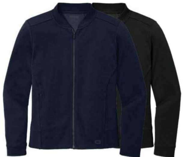
OGIO Ladies Hinge Full-Zip LOG820 Women's Sizes: XS-4XL | 3 colors