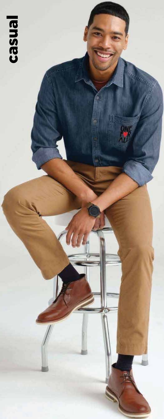
PORT AUTHORITY Long Sleeve Perfect Denim Shirt W676 Adult Sizes: XS-4XL | 2 colors