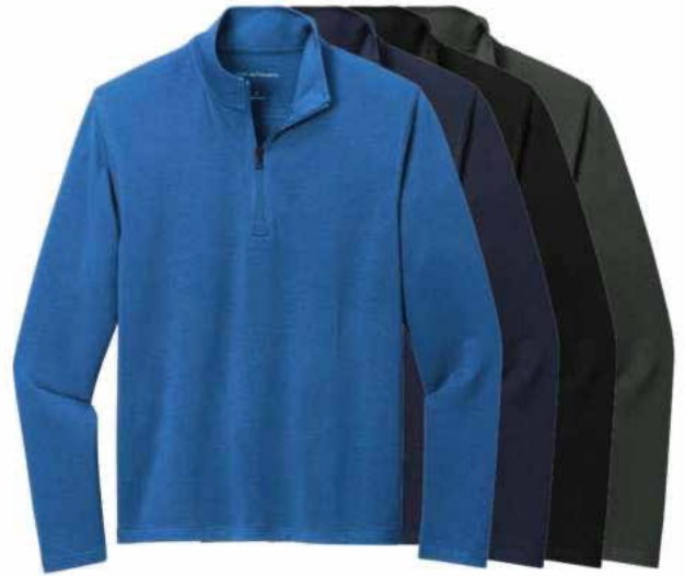
PORT AUTHORITY Microterry 1/4-Zip Pullover K825 Adult Sizes: XS-4XL | 4 colors