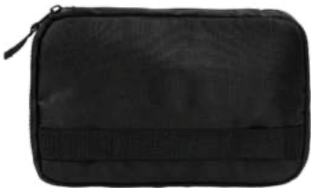
MERCER + METTLE Utility Case MMB700 1 color