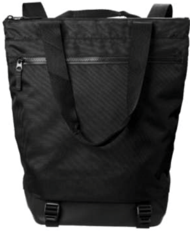
MERCER + METTLE Convertible Tote MMB202 1 color