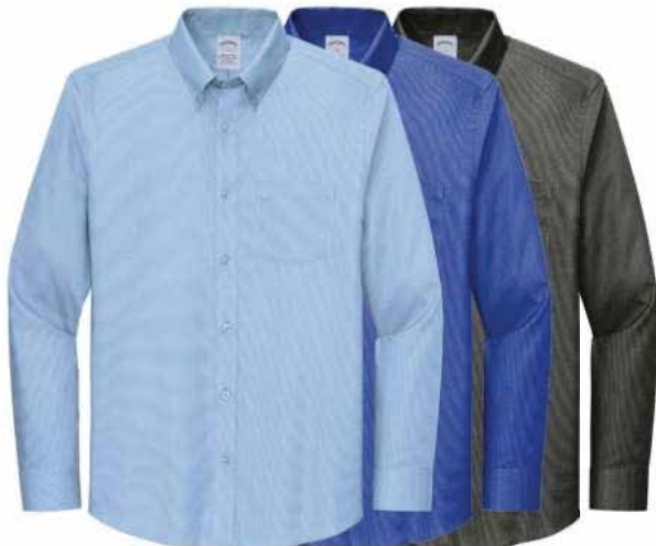
BROOKS BROTHERS Wrinkle Free Stretch Nailhead Shirt BB18002 Adult Sizes: XS-4XL | 6 colors