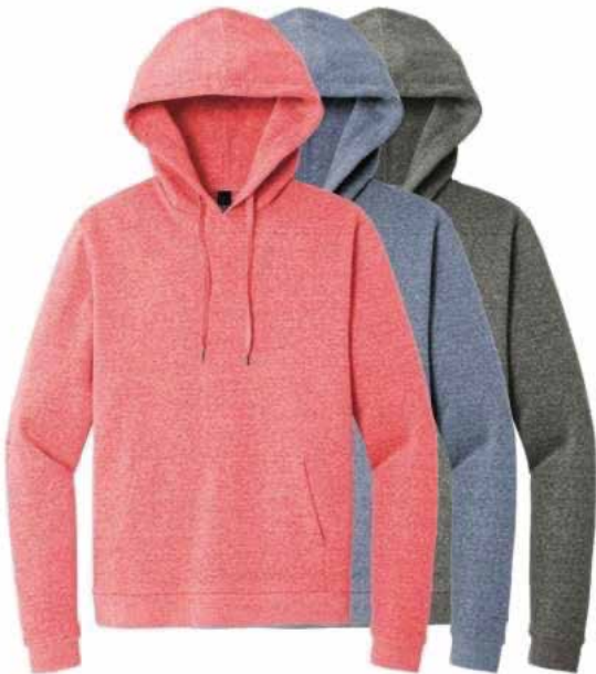
DISTRICT Perfect Tri Fleece Pullover Hoodie DT1300 Adult Sizes: XS-4XL | 12 colors