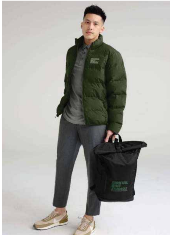
MERCER + METTLE Rucksack MMB201 One Size Fits All | 1 color Worn with TM1MU412, MM7210