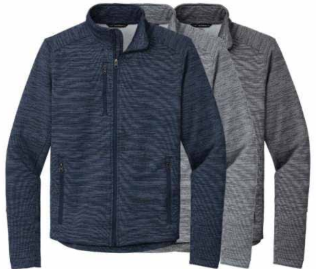
PORT AUTHORITY Digi Stripe Fleece Jacket F231 Adult Sizes: XS-4XL | 3 colors