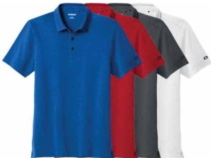
OGIO Limit Polo OG138 Adult Sizes: XS-4XL | 6 colors