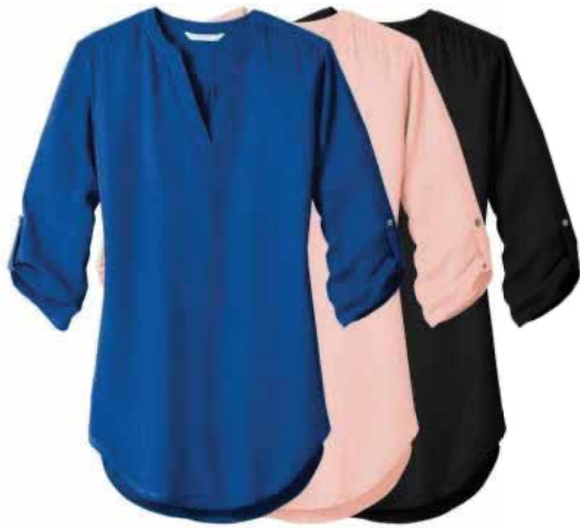
PORT AUTHORITY Ladies 3/4-Sleeve Tunic Blouse LW701 Women's Sizes: XS-4XL | 8 colors

Uplift the whole team with outfits that speak to a cohesive vision, a laid-back attitude and a clear focus on accomplishing great work together.