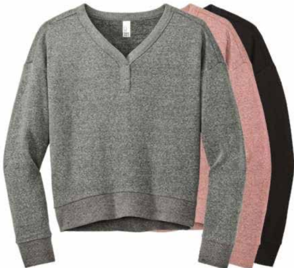
DISTRICT Ladies Perfect Tri Fleece V-Neck Sweatshirt DT1312 Women's Sizes: XS-4XL | 5 colors