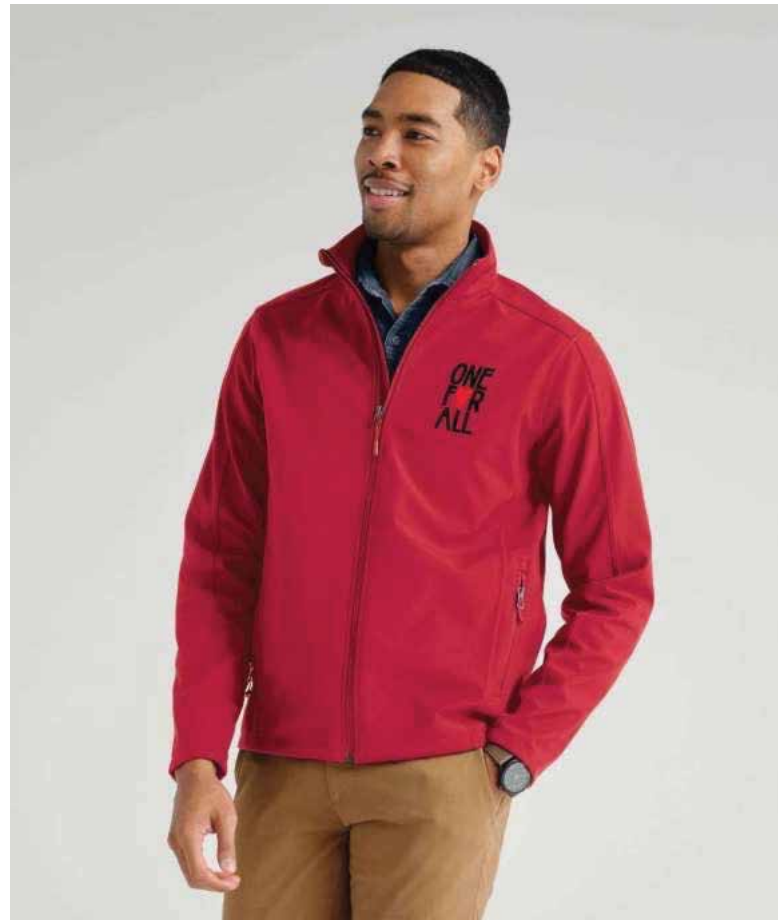
PORT AUTHORITY Core Soft Shell Jacket J317 Adult Sizes: XS-6XL | 11 colors Worn with W676