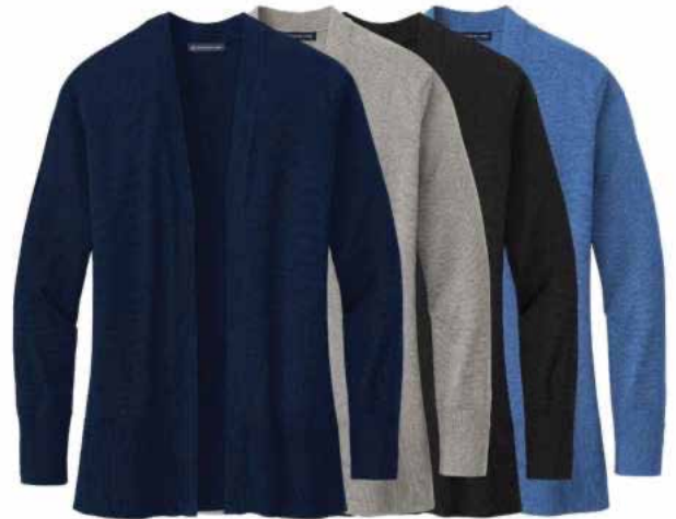
BROOKS BROTHERS Women's Cotton Stretch Long Cardigan Sweater BB18403 Women's Sizes: XS-4XL | 4 colors