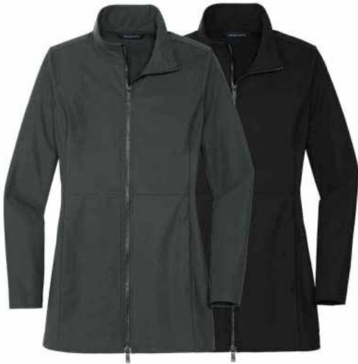
MERCER + METTLE Women's Faille Soft Shell MM7101 Women's Sizes: XS-4XL | 2 colors