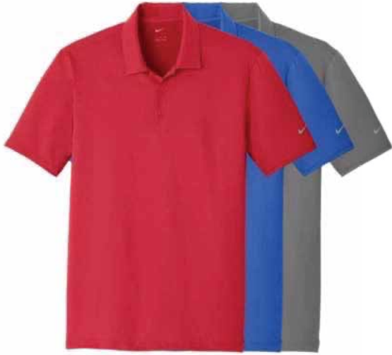
NIKE Dri-FIT Legacy Polo 883681 Adult Sizes: XS-4XL | 6 colors