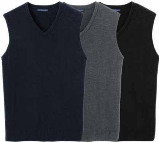
PORT AUTHORITY Sweater Vest SW286 Adult Sizes: XS-4XL | 3 colors