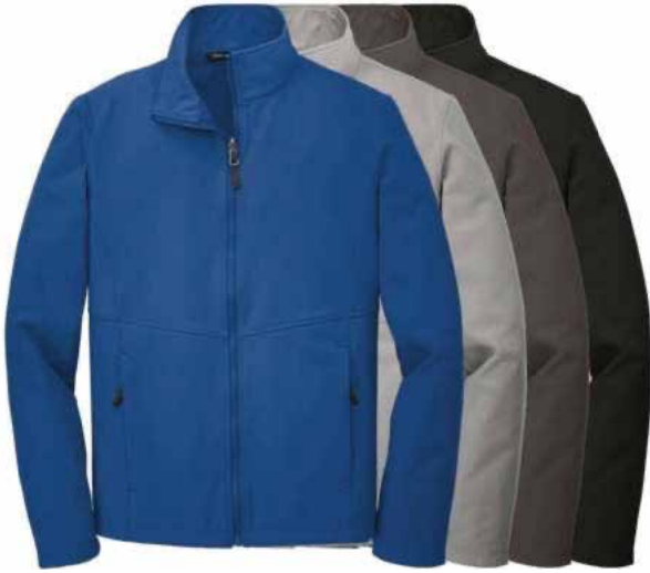
PORT AUTHORITY Collective Soft Shell Jacket J901 Adult Sizes: XS-4XL | 5 colors