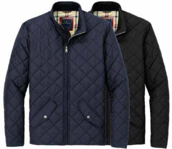
BROOKS BROTHERS Quilted Jacket BB18600 Adult Sizes: XS-4XL | 2 colors