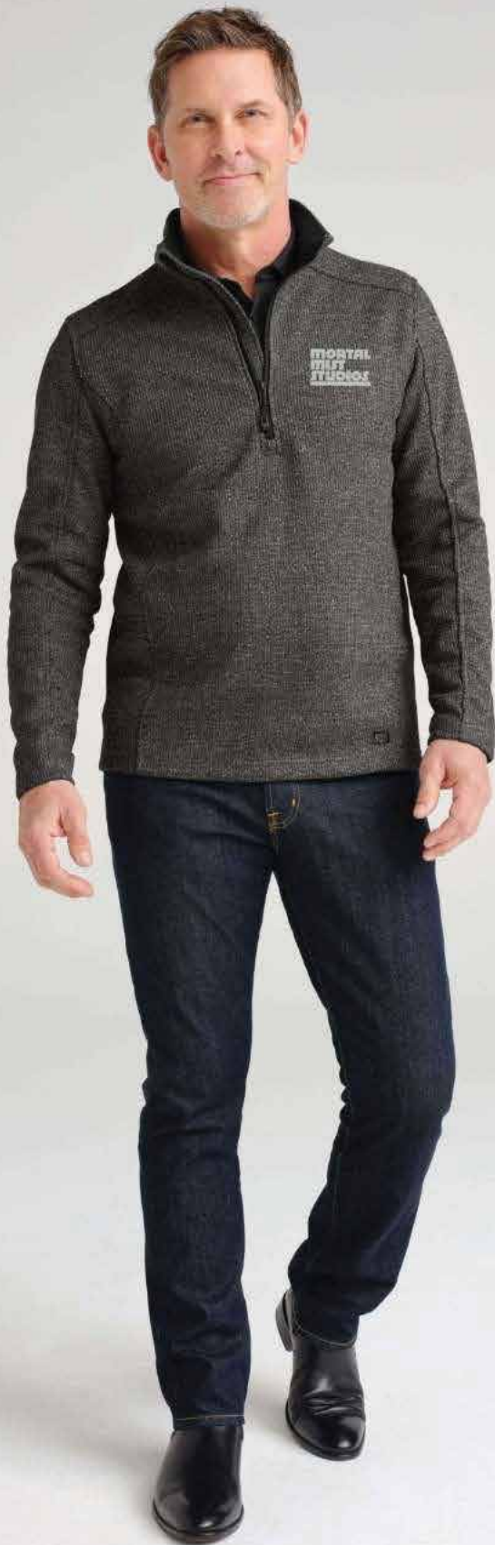
OGIO Grit Fleece 1/2-Zip OG729 Adult Sizes: XS-4XL | 2 colors Worn with TM1MY399