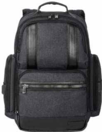
BROOKS BROTHERS Grant Backpack BB18820 1 color

Heat Transfer is the most effective technique for these styles