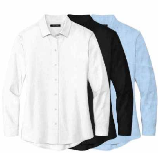
MERCER + METTLE Women's Long Sleeve Stretch Woven Shirt MM2001 Women's Sizes: XS-4XL | 4 colors