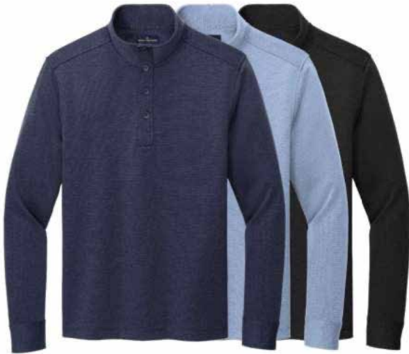
BROOKS BROTHERS Mid-Layer Stretch 1/2 Button BB18202 Adult Sizes: XS-4XL | 5 colors