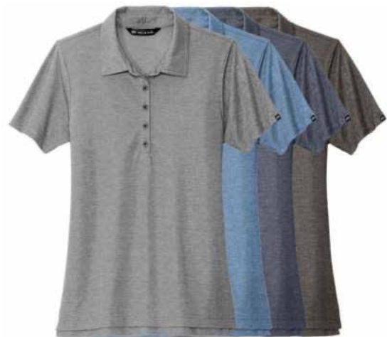
TRAVISMATHEW Ladies Oceanside Heather Polo TM1WW002 Women's Sizes: S-2XL | 6 colors