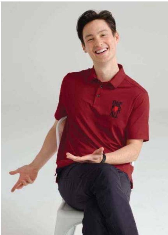
PORT AUTHORITY City Stretch Polo K682 Adult Sizes: XS-4XL | 6 colors