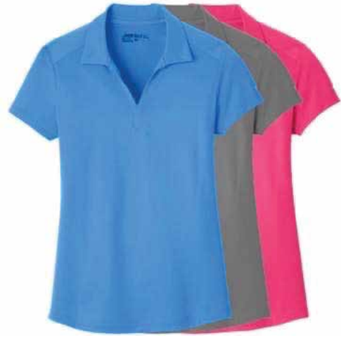
NIKE Ladies Dri-FIT Legacy Polo 838957 Women's Sizes: XS-2XL | 6 colors