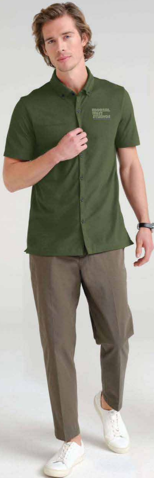
MERCER + METTLE Stretch Pique Full-Button Polo MM1006 Adult Sizes: XS-4XL | 7 colors