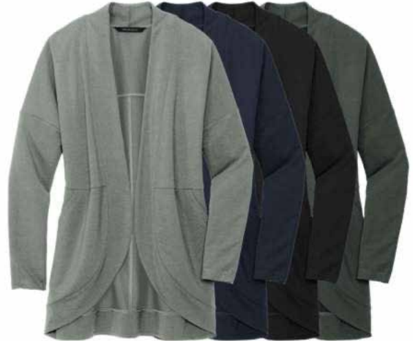
MERCER + METTLE Women's Stretch Open-Front Cardigan MM3015 Women's Sizes: XS-4XL | 4 colors