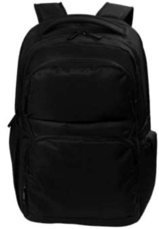
PORT AUTHORITY Transit Backpack BG224 1 color