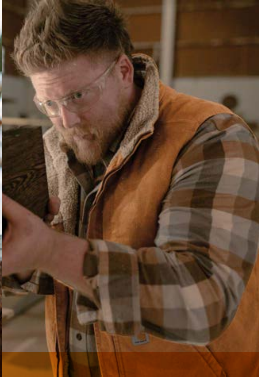
Sherpa-Lined Mock Neck Vest CT104277