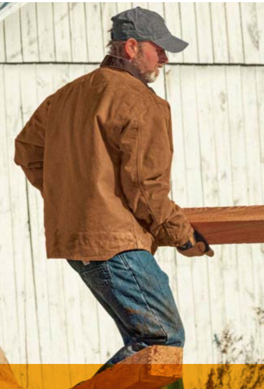
Duck Traditional Coats CTC003 | CTTC003 (Tall)