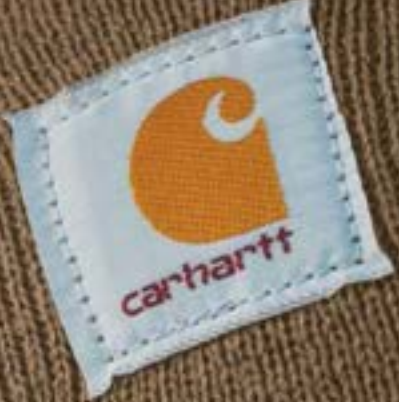
Acrylic Knit Hat CTA205