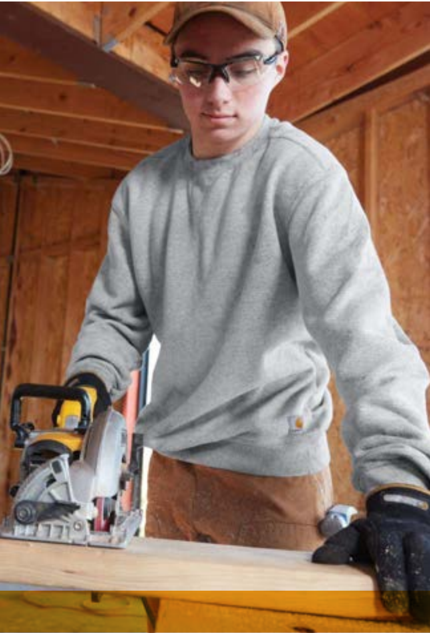
Midweight Crewneck Sweatshirt CTK124