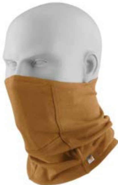
Cotton Blend Filter Pocket Gaiter CT105086