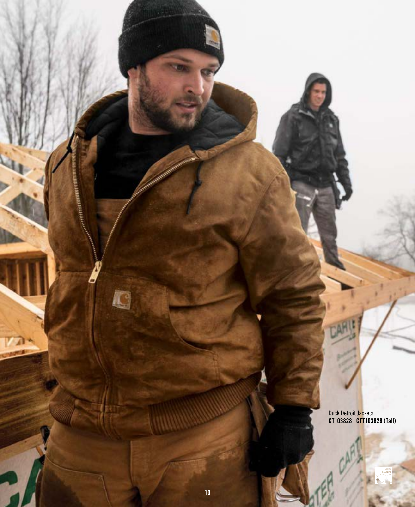
Duck Detroit Jackets CT103828 | CTT103828 (Tall)