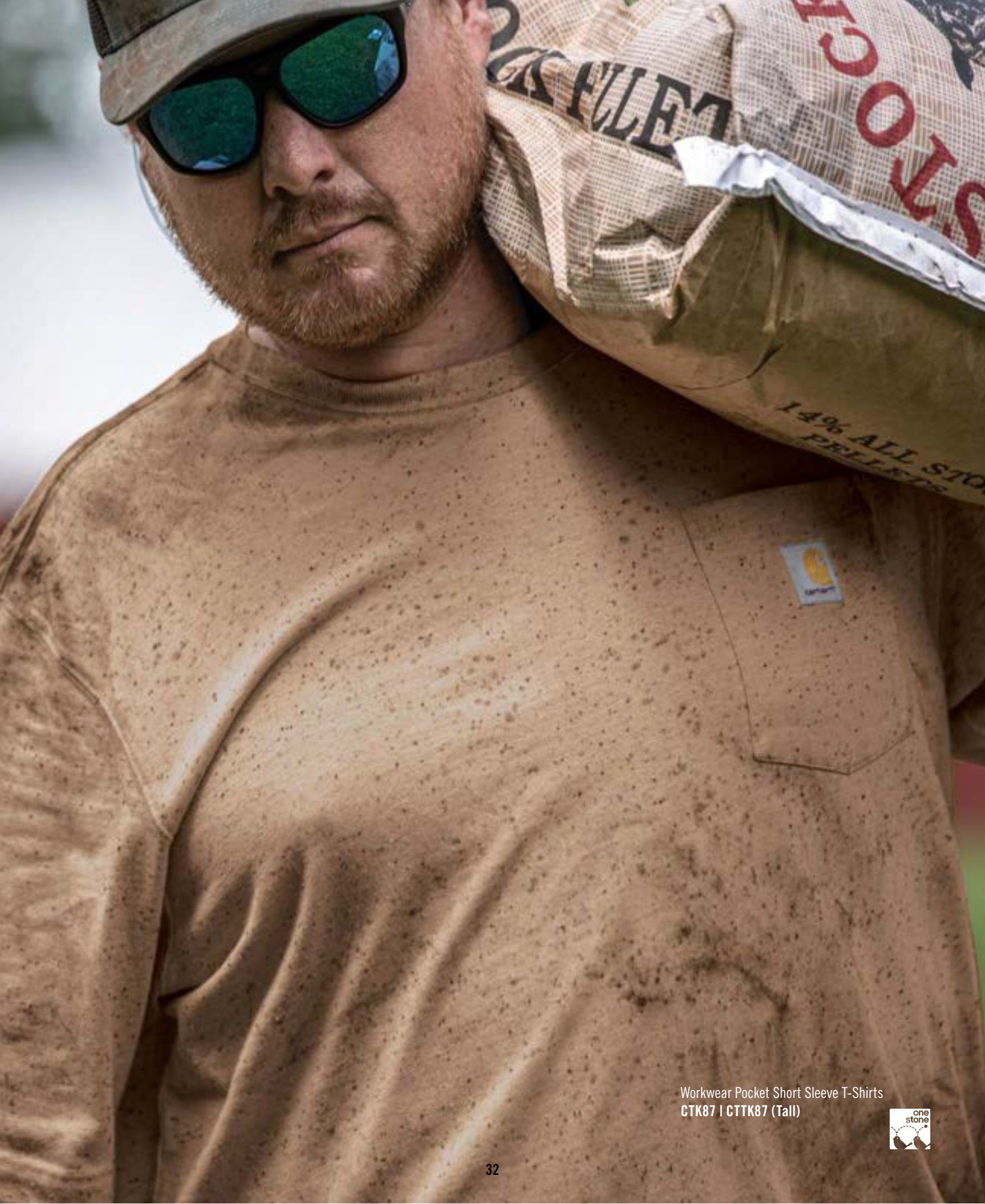
Workwear Pocket Short Sleeve T-Shirts CTK87 | CTTK87 (Tall)