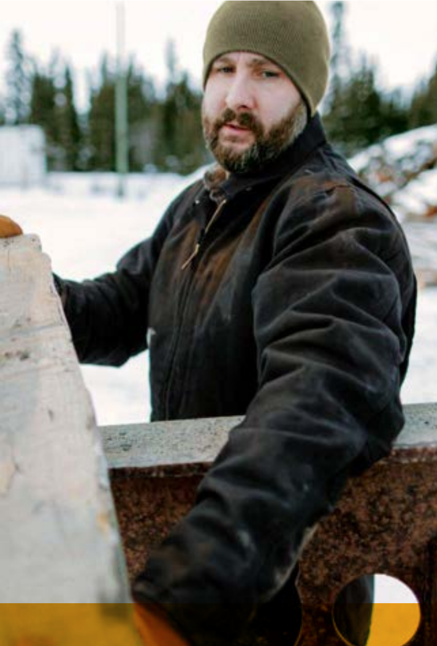
Sherpa-Lined Coats CT104293 | CTT104293 (Tall)