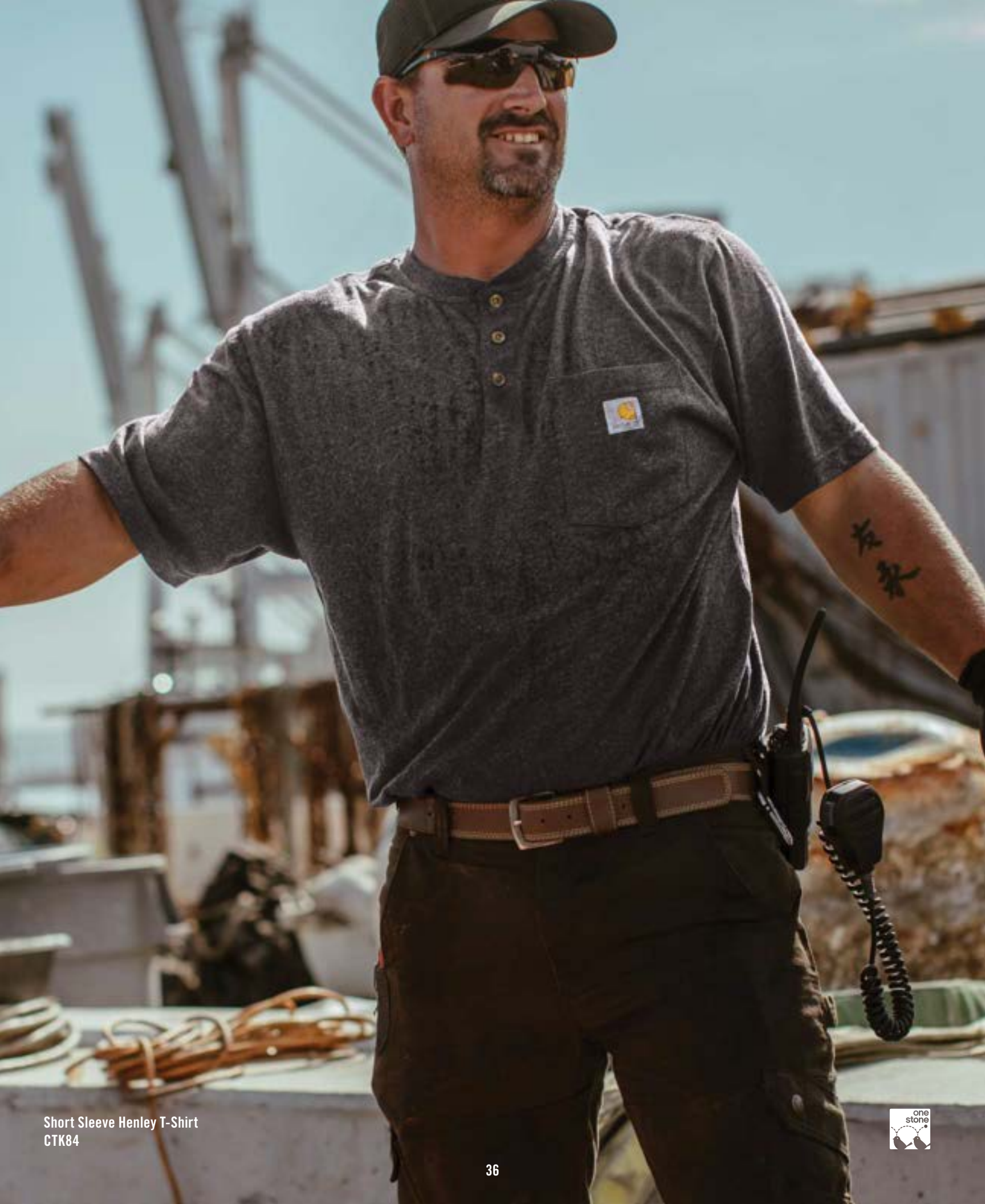
Short Sleeve Henley T-Shirt CTK84