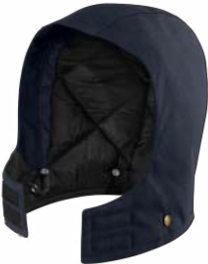
Firm Duck Hood CT102368