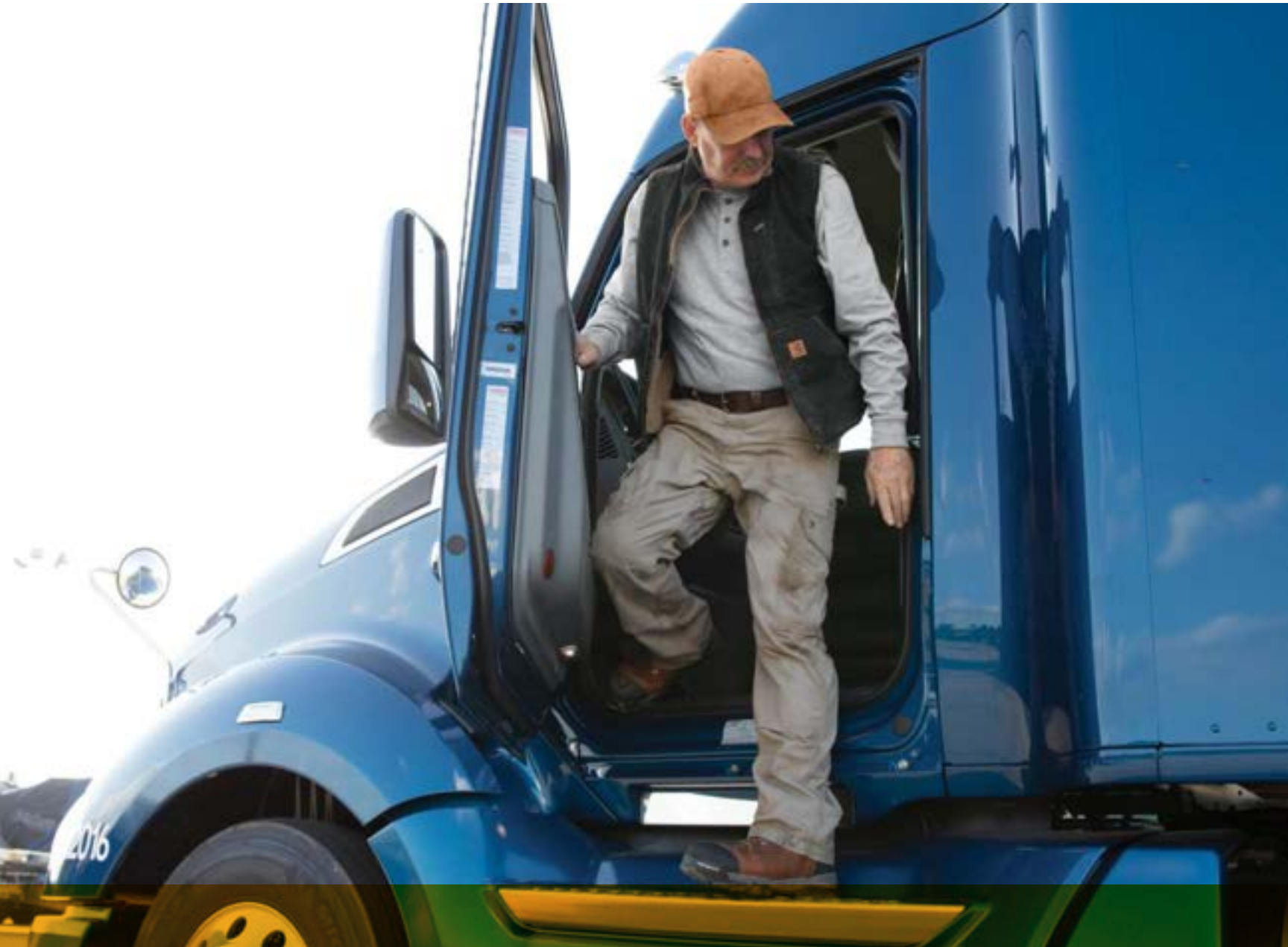
Long Sleeve Henley T-Shirt CTK128