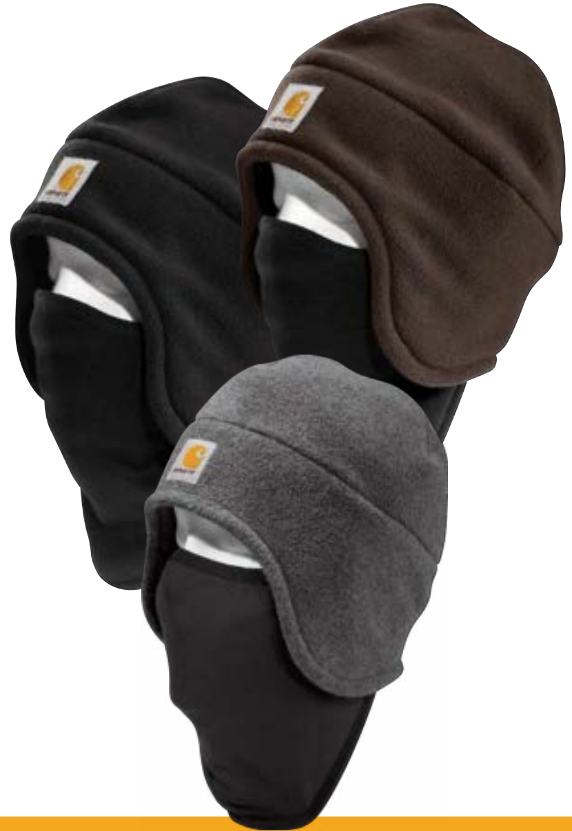
Fleece Hat CTA207