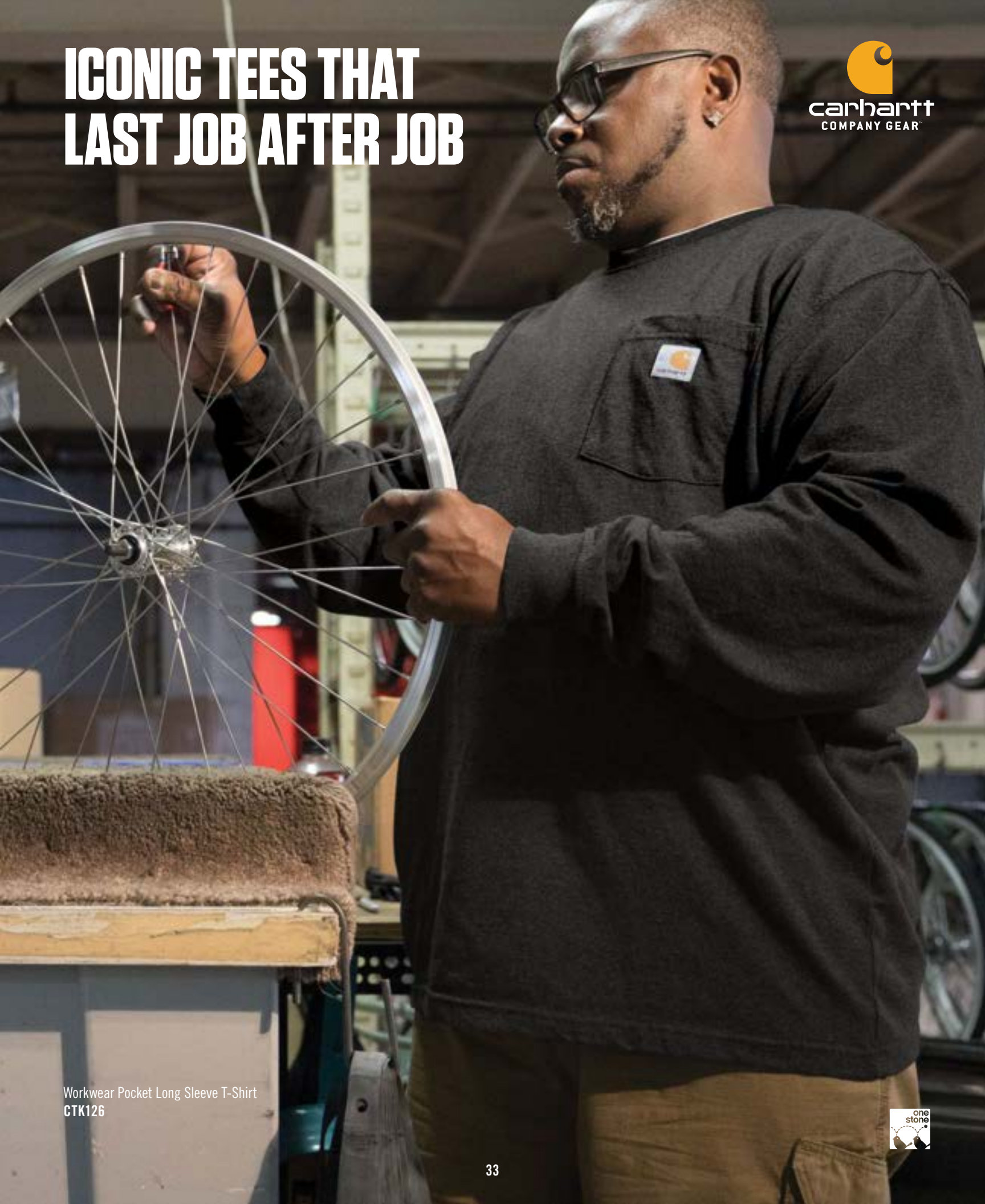
Workwear Pocket Long Sleeve T-Shirt CTK126