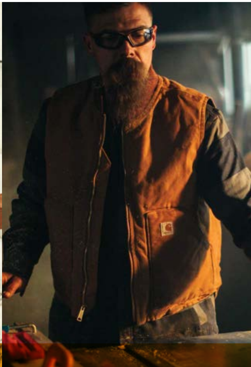
Duck Vest CTV01