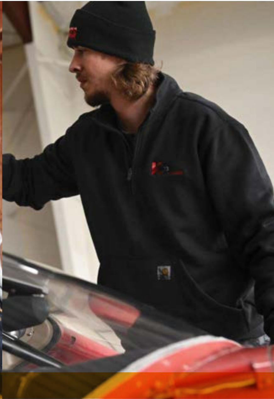
Midweight 1/4-Zip Mock Neck Sweatshirt CT105294