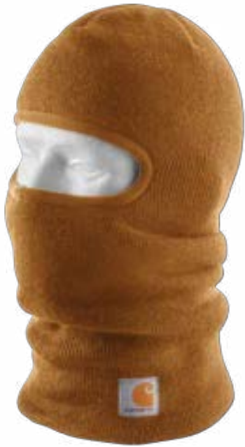
Knit Insulated Face Mask CT104485