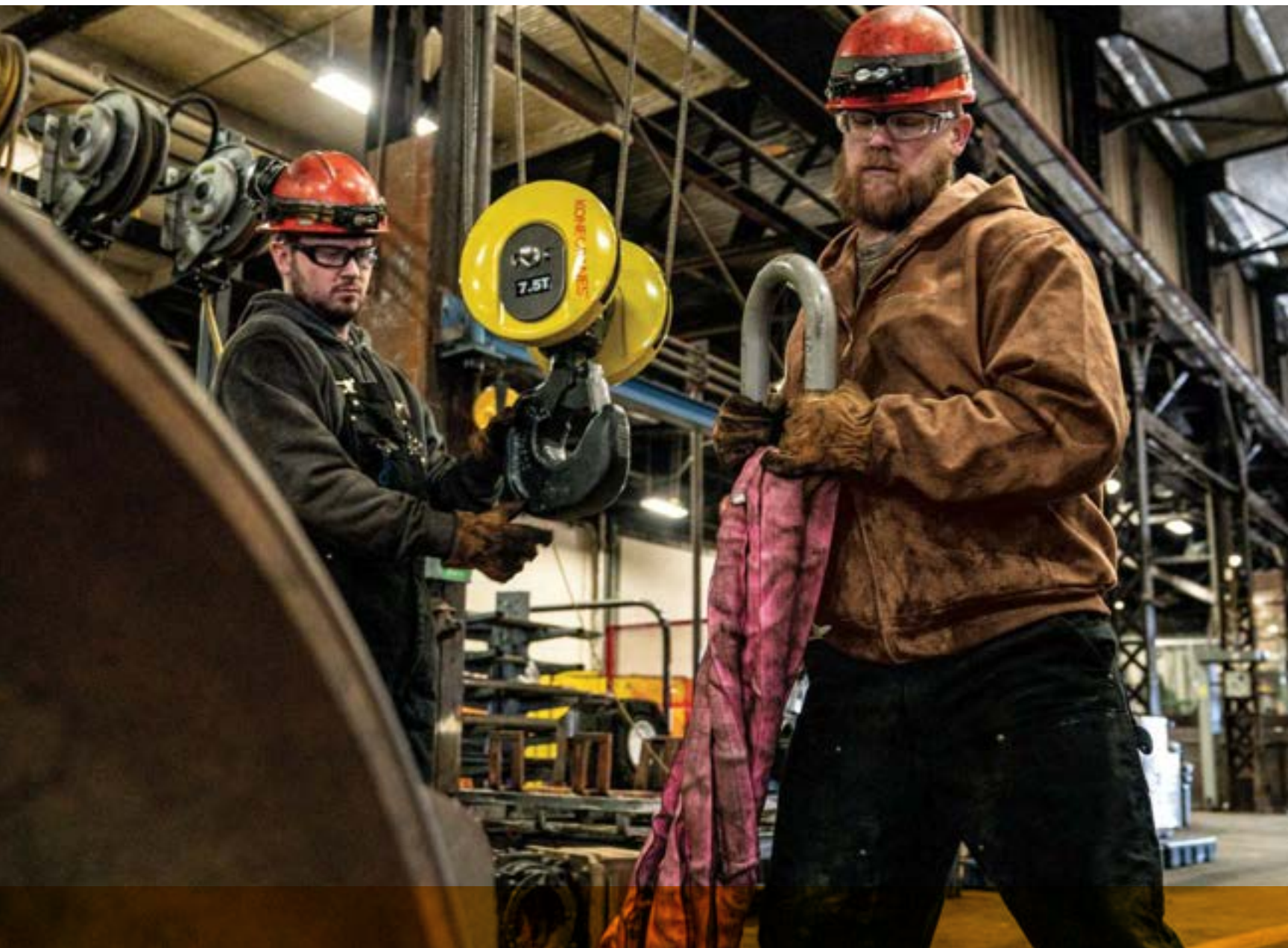
Thermal-Lined Duck Active Jacs CTJ131 | CTTJ131 (Tall)